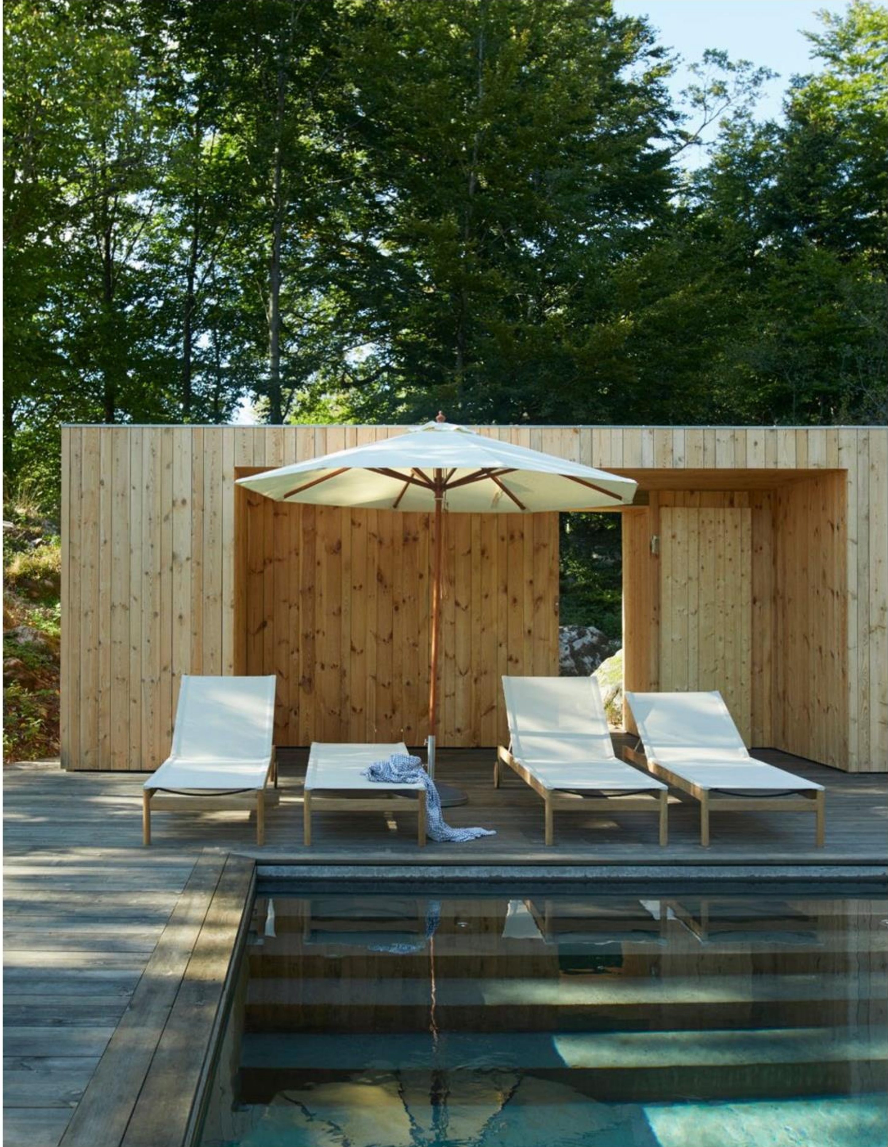
Pelagus Sunbeds in teak and Sling fabric