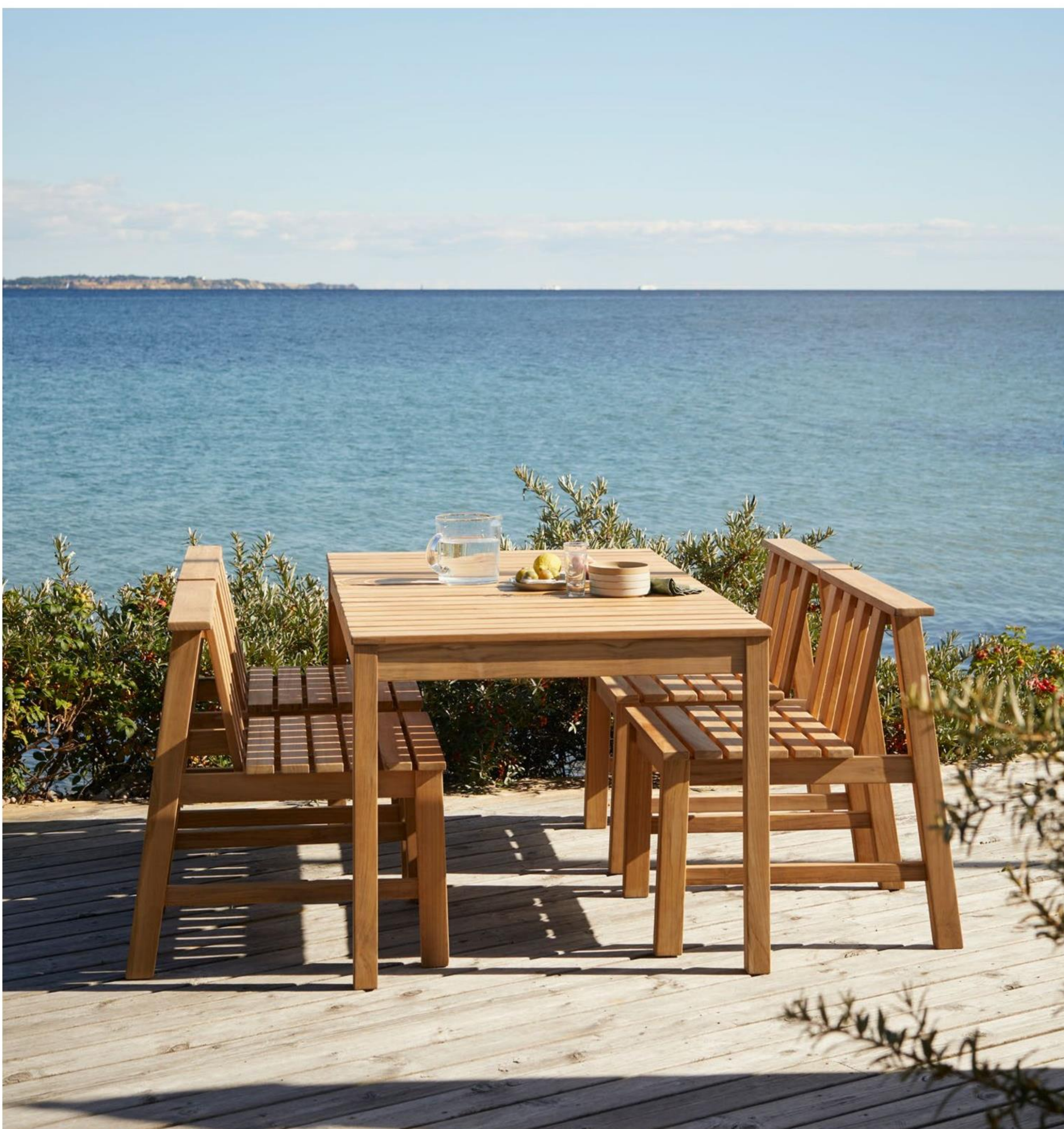
Plank Chair and Table in teak