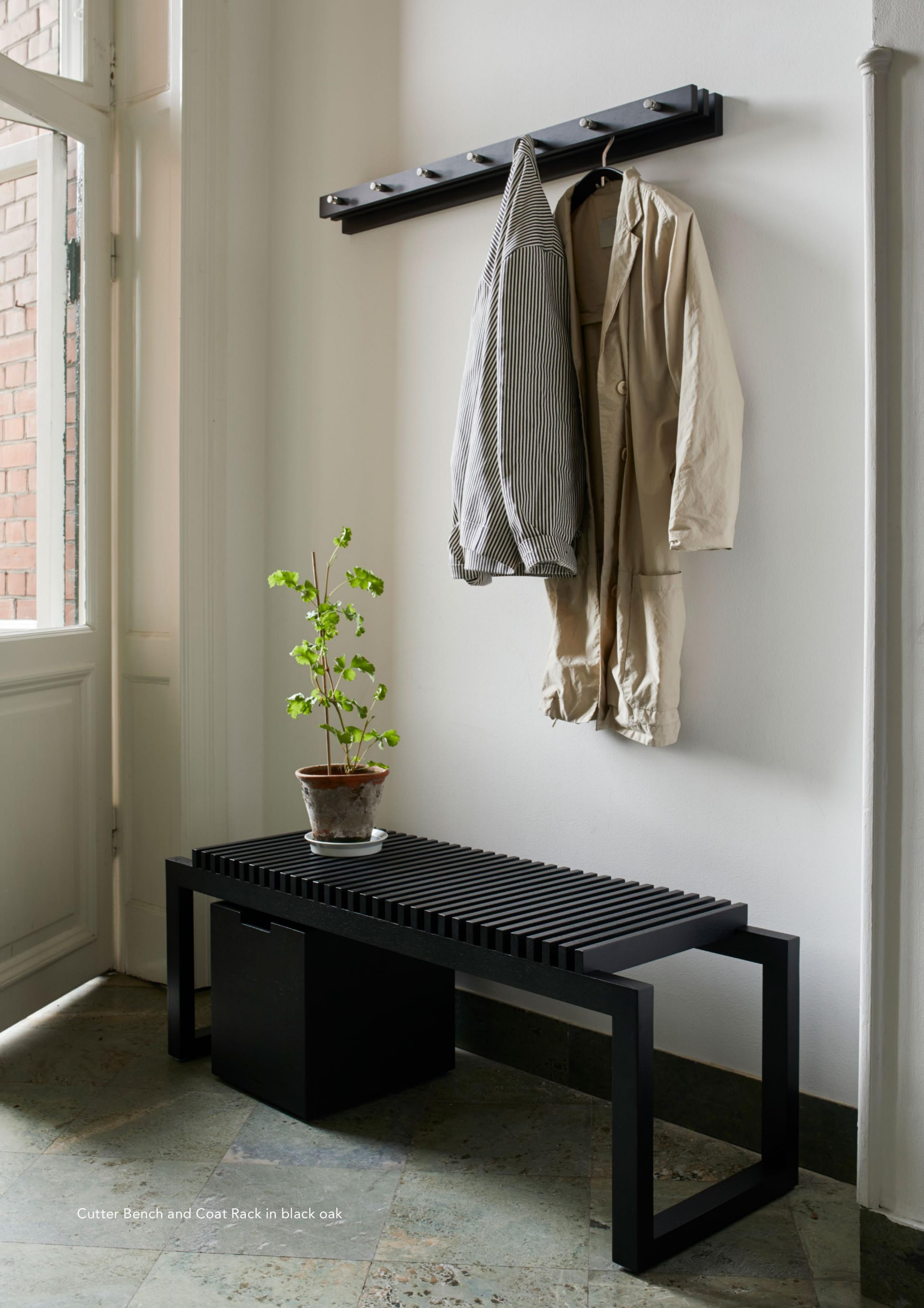
Cutter Bench and Coat Rack in black oak