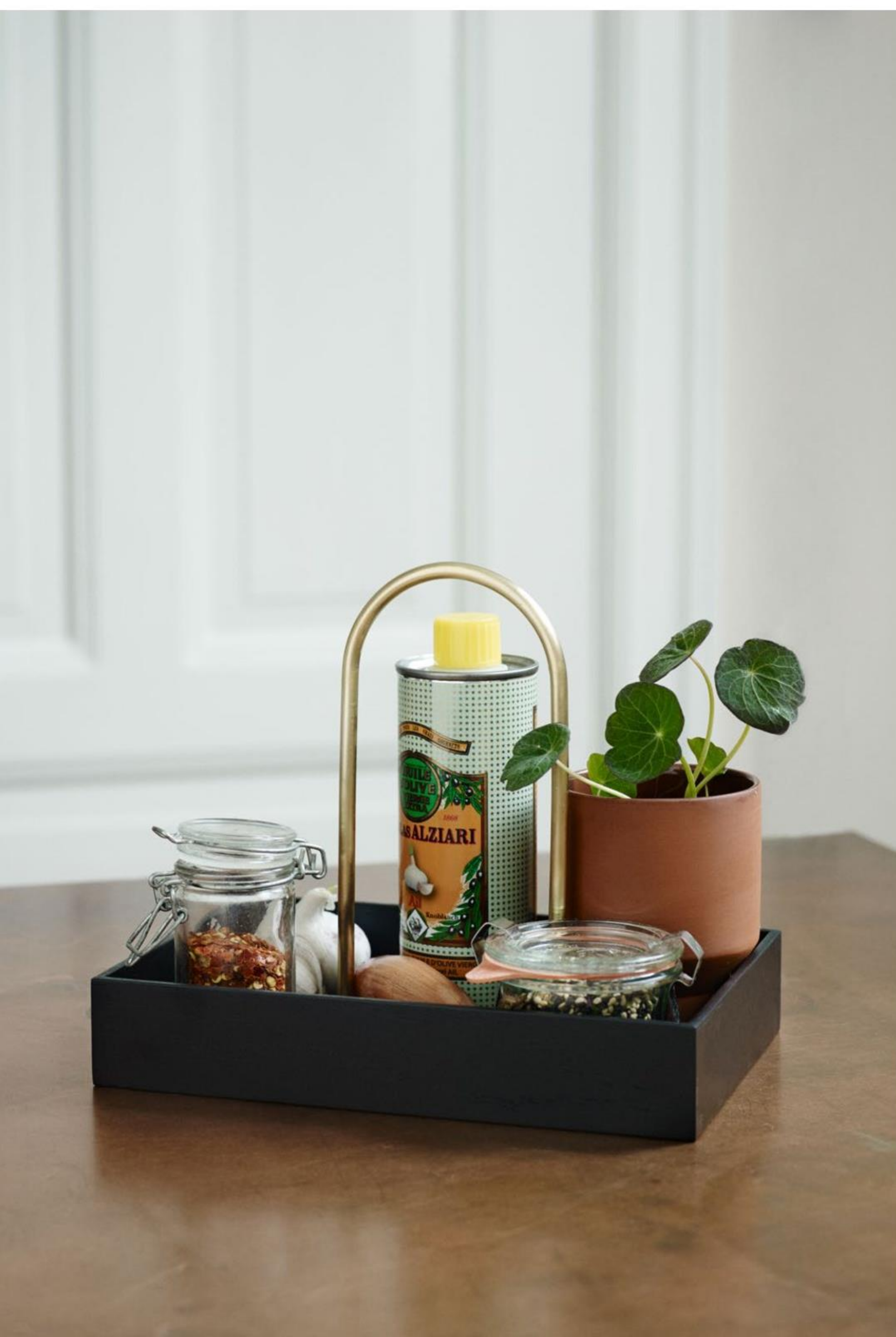
Norr Carrier in black oak