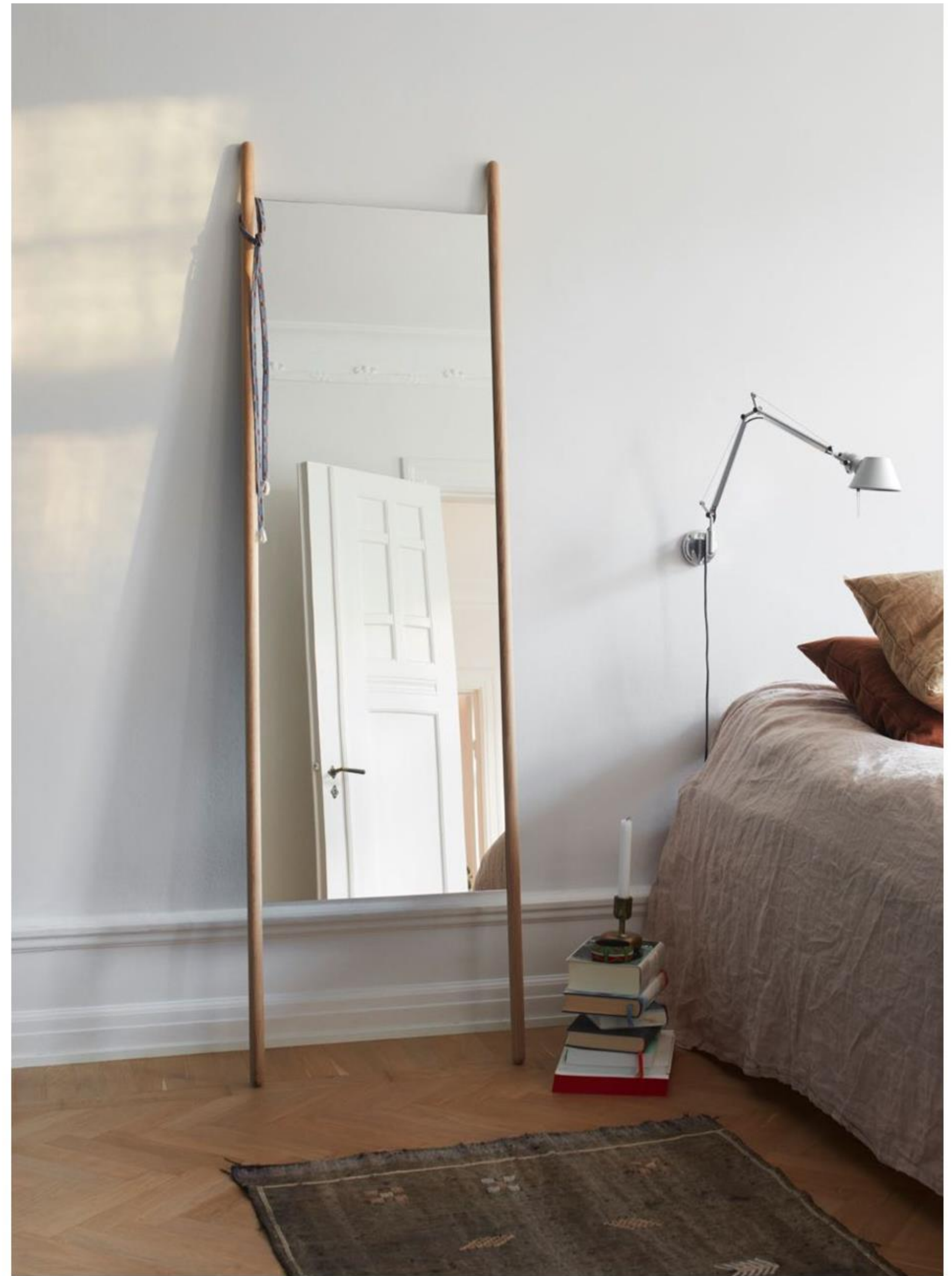
Georg Mirror in oak

Georg is a collection of functional furniture and accessories made from a warm mix of Nordic sensuality and Japanese minimalism, all made in 100% FSC™-certified oak. The iconic Georg Stool is one of our bestselling products.