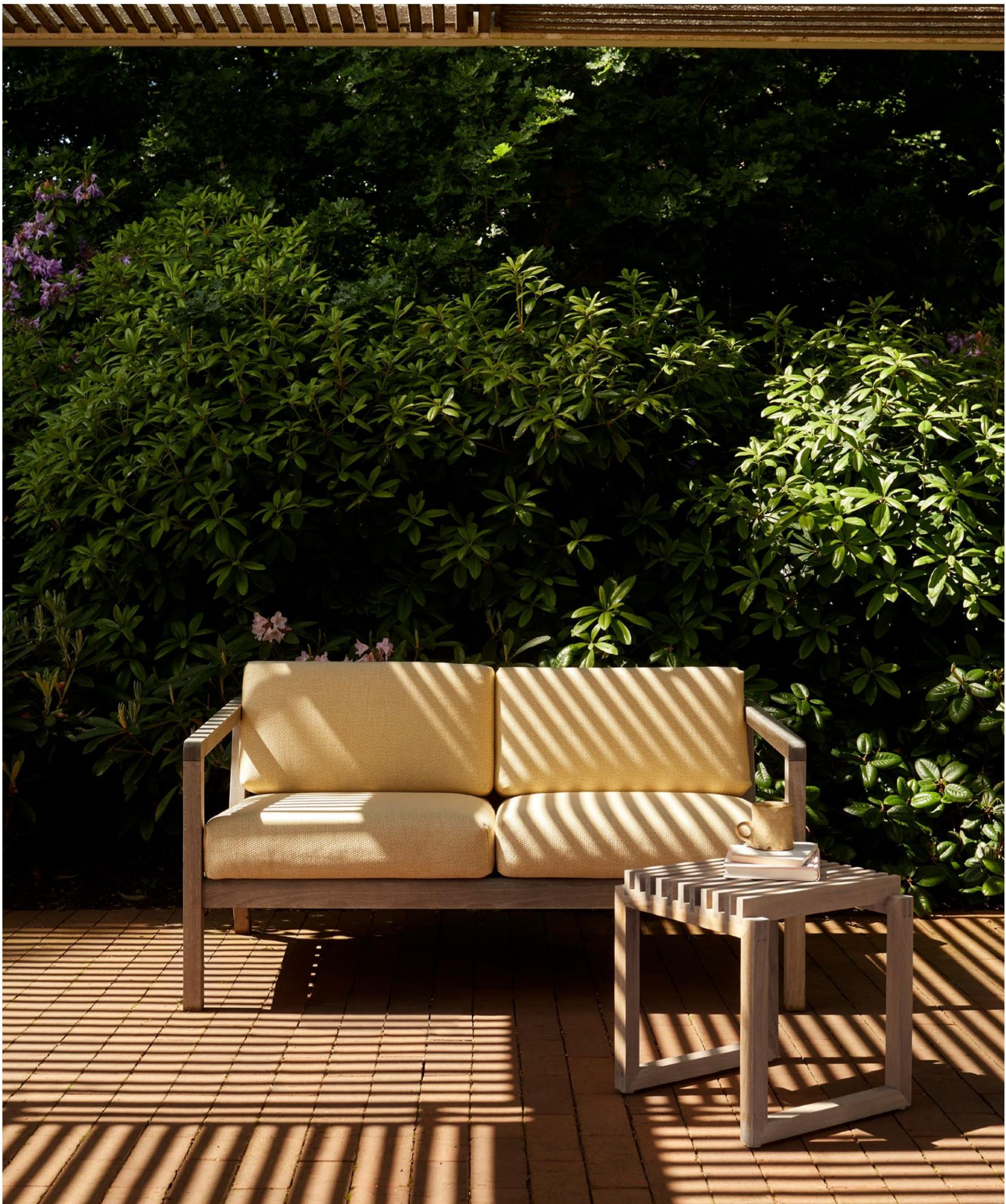
Virkelyst 2-seater in teak and honey yellow Sunbrella fabric and Cutter Stool in teak

Virkelyst is a collection of modern outdoor furniture with the seating comfort of an indoor furniture. The simple wooden frame strikes a contrast with the thick, soft Oeko-Tex certified cushions that are extremely weather-resistant.