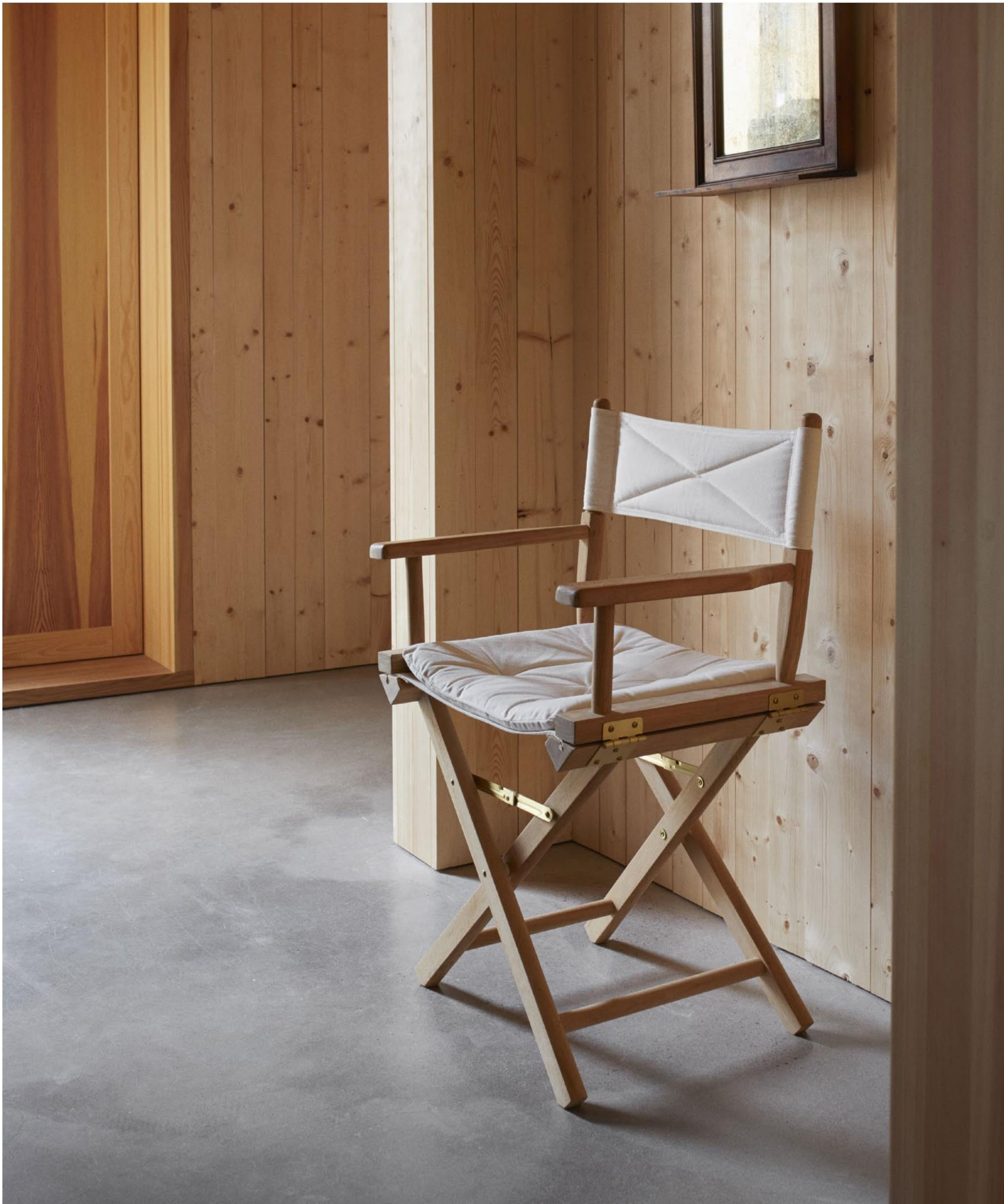
Director's Chair in teak and canvas