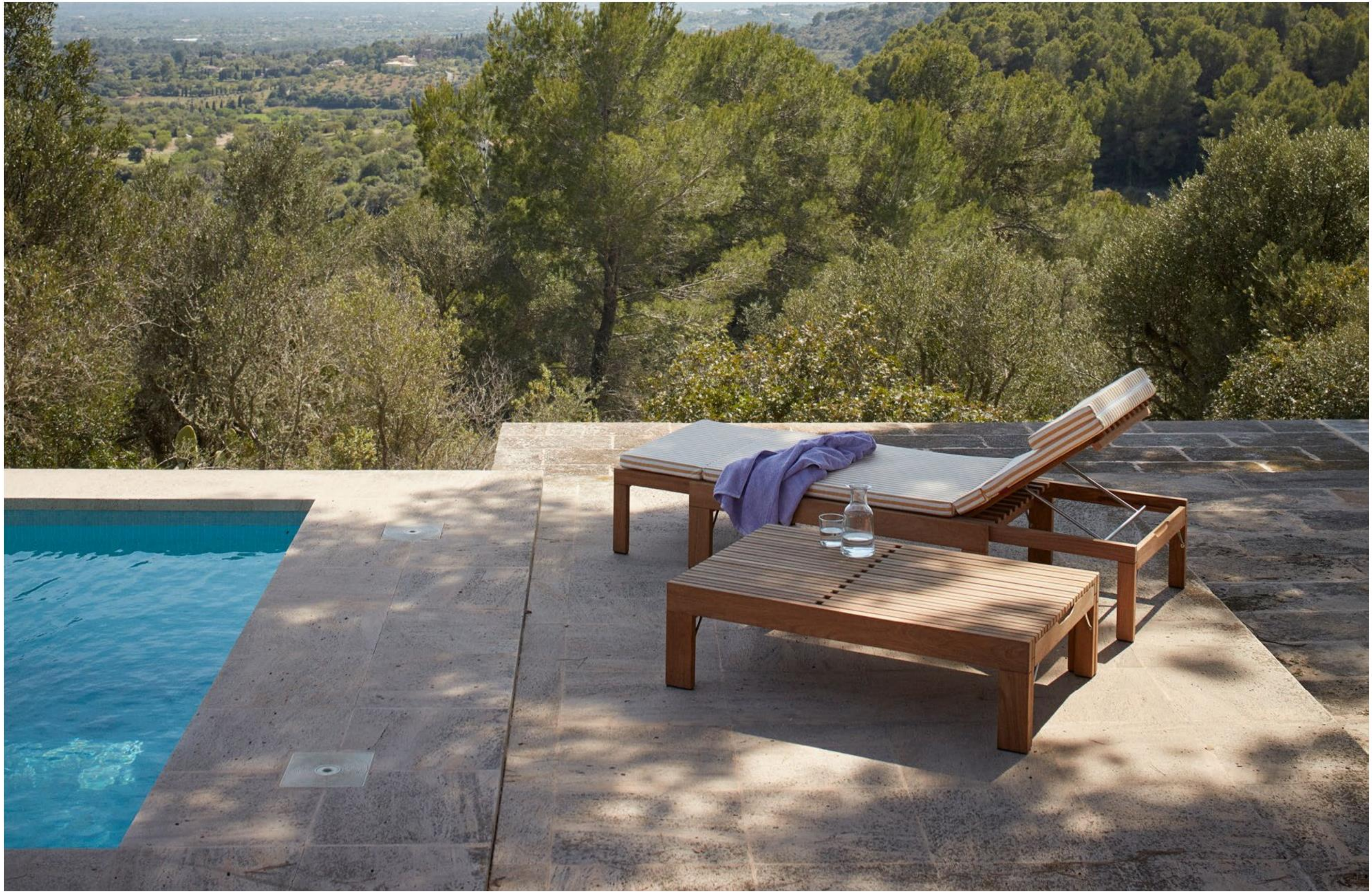
Riviera Sunbed in teak