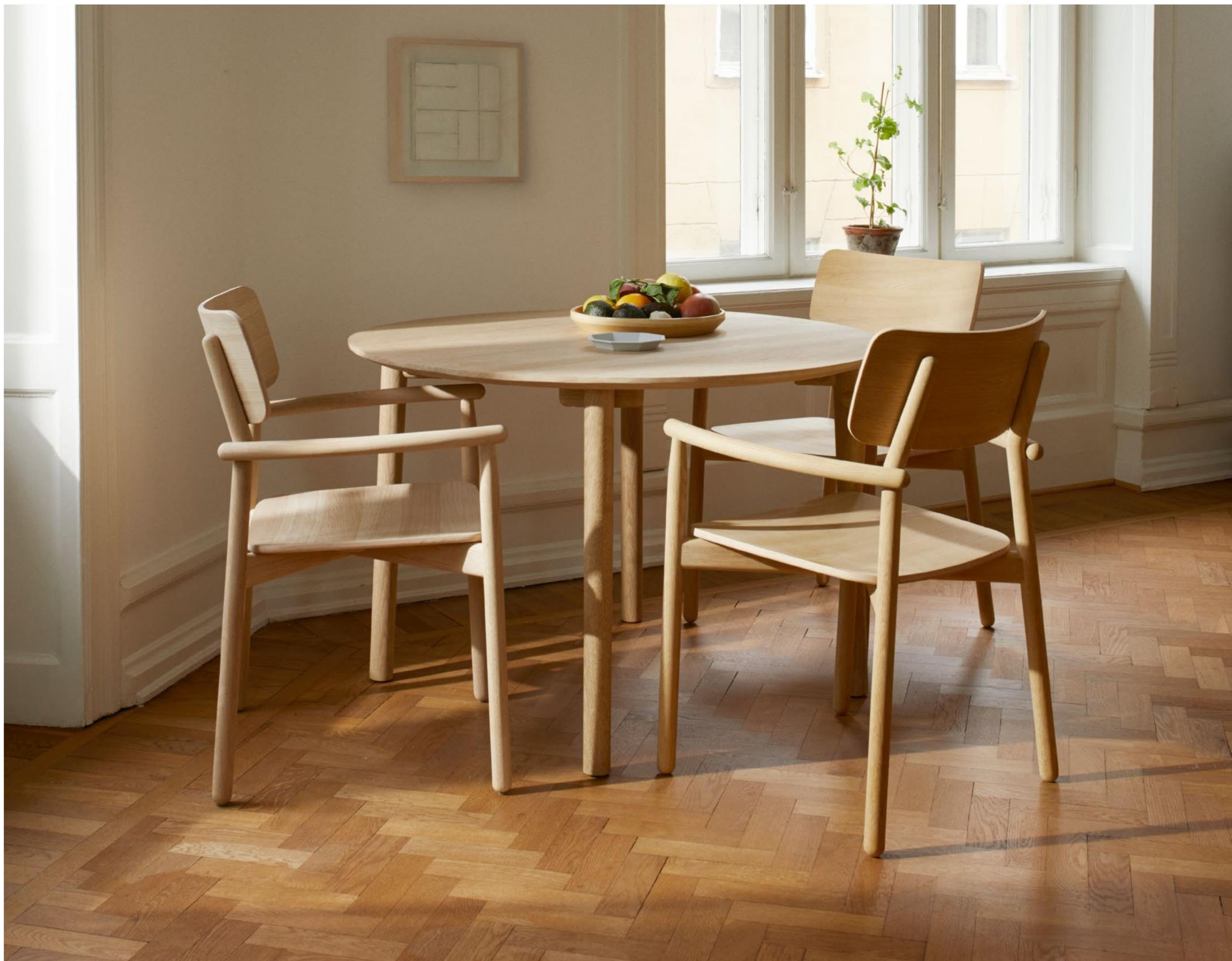
Hven Armchair and Table in oak

Hven is a collection of minimalistic and timeless furniture characterised by its round legs and corners. All designs are available in 100% FSC™-certified oak.