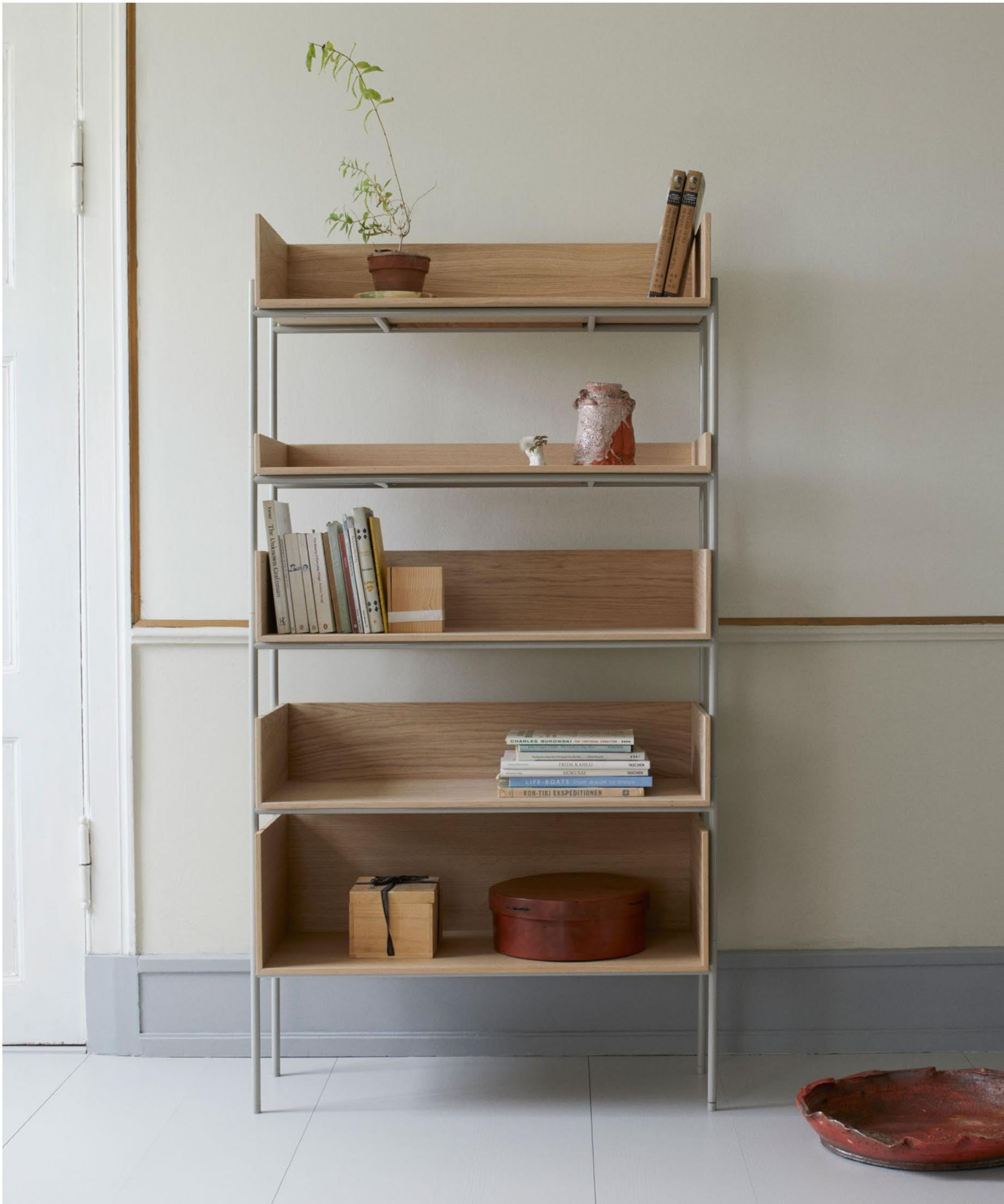
Vivlio Shelf in oak and Frame in Silk Grey steel