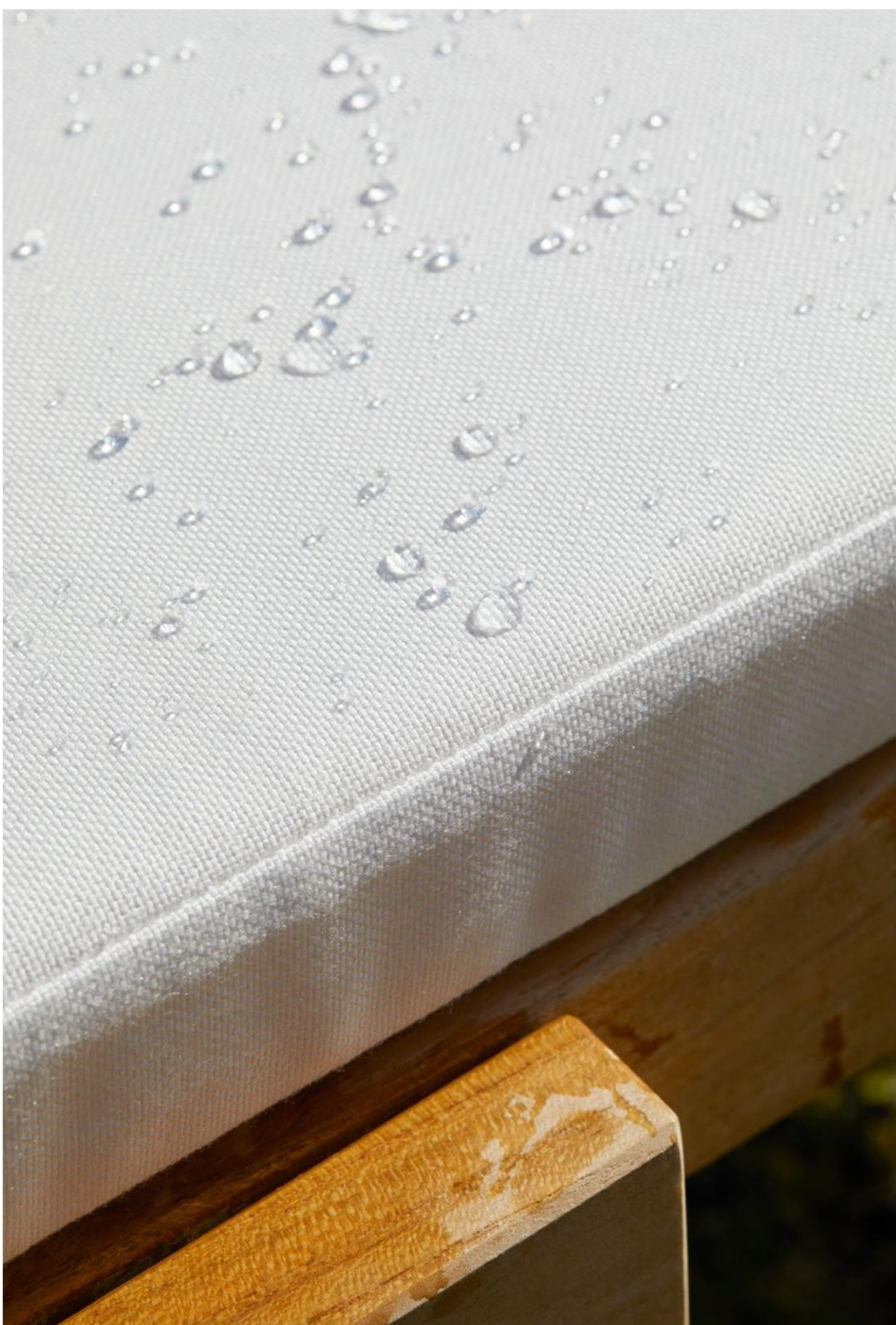
Cushion in water-repellant fabric