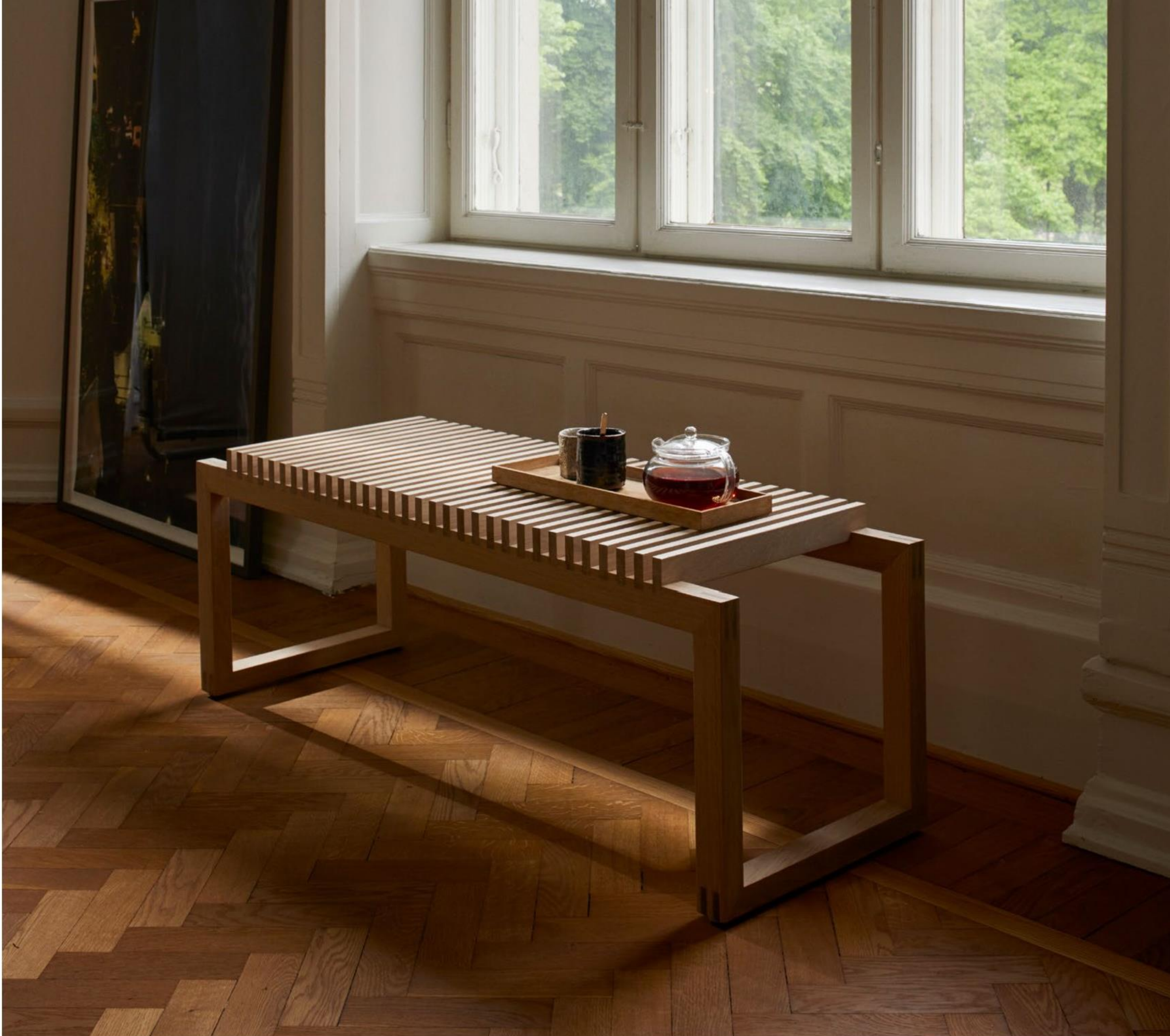
Cutter Bench and Nomad Tray in oak