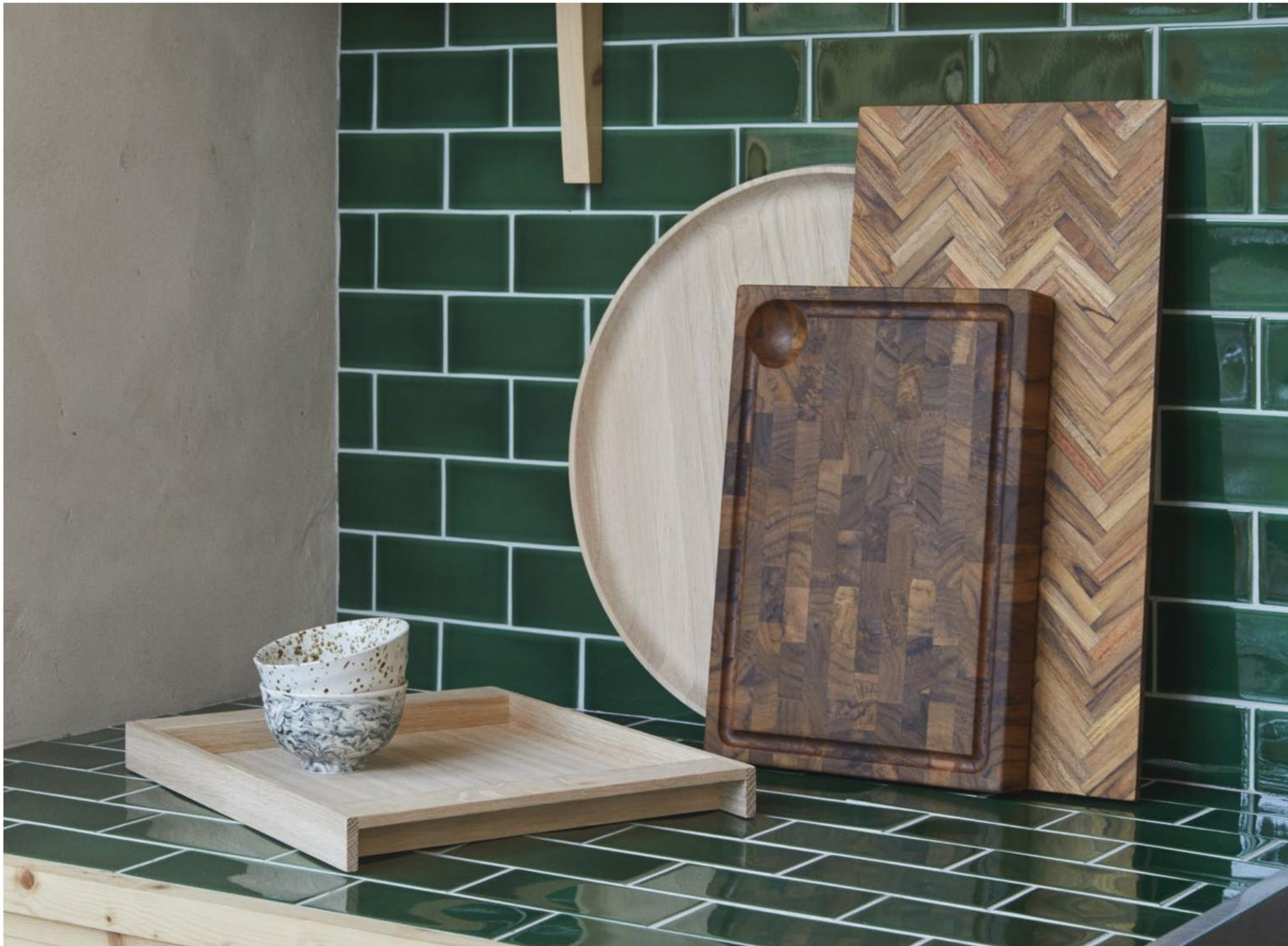
Dania and Sild Cutting Boards and No. 10 and Nordic Trays