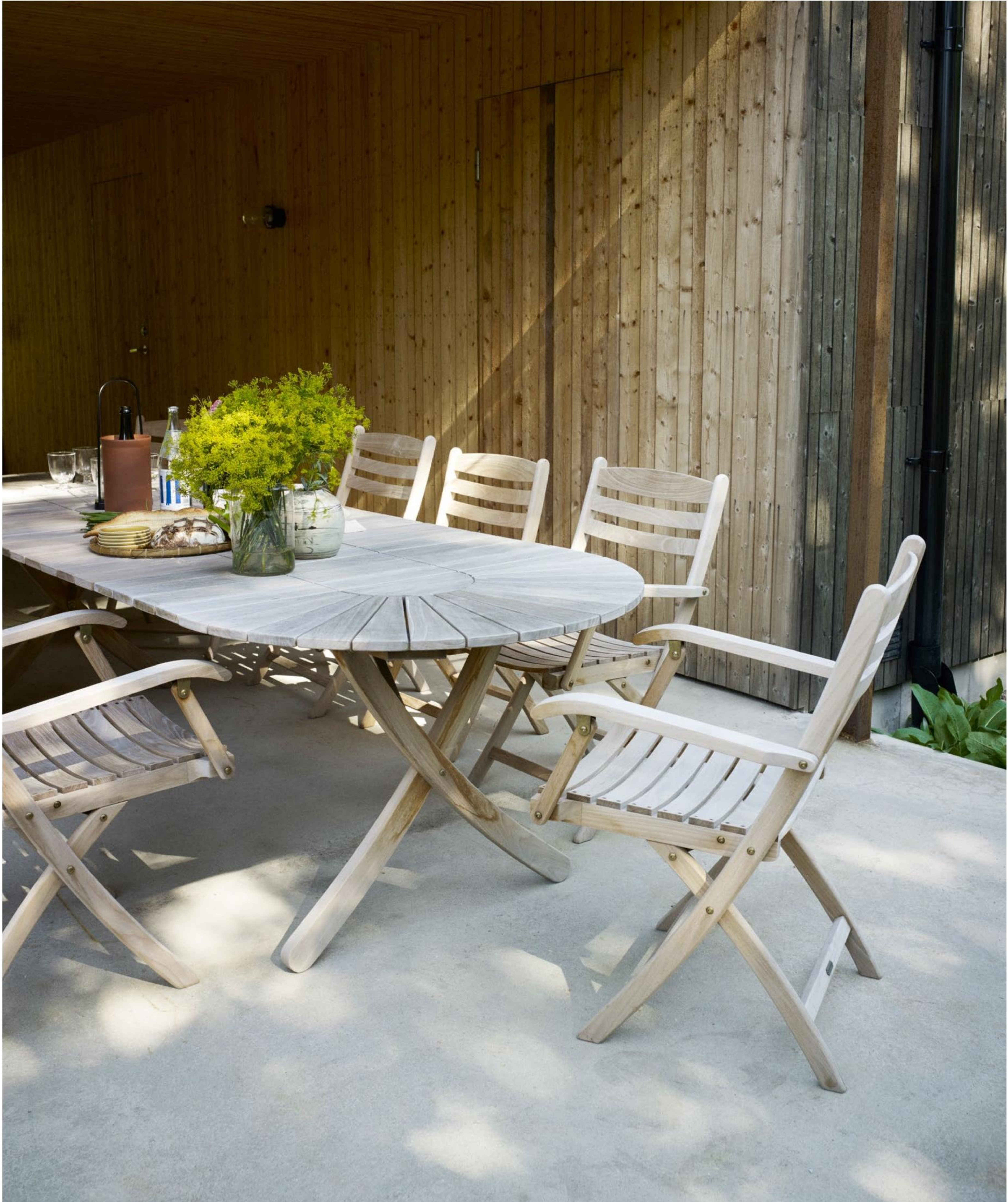
Selandia Armchair and Table in teak