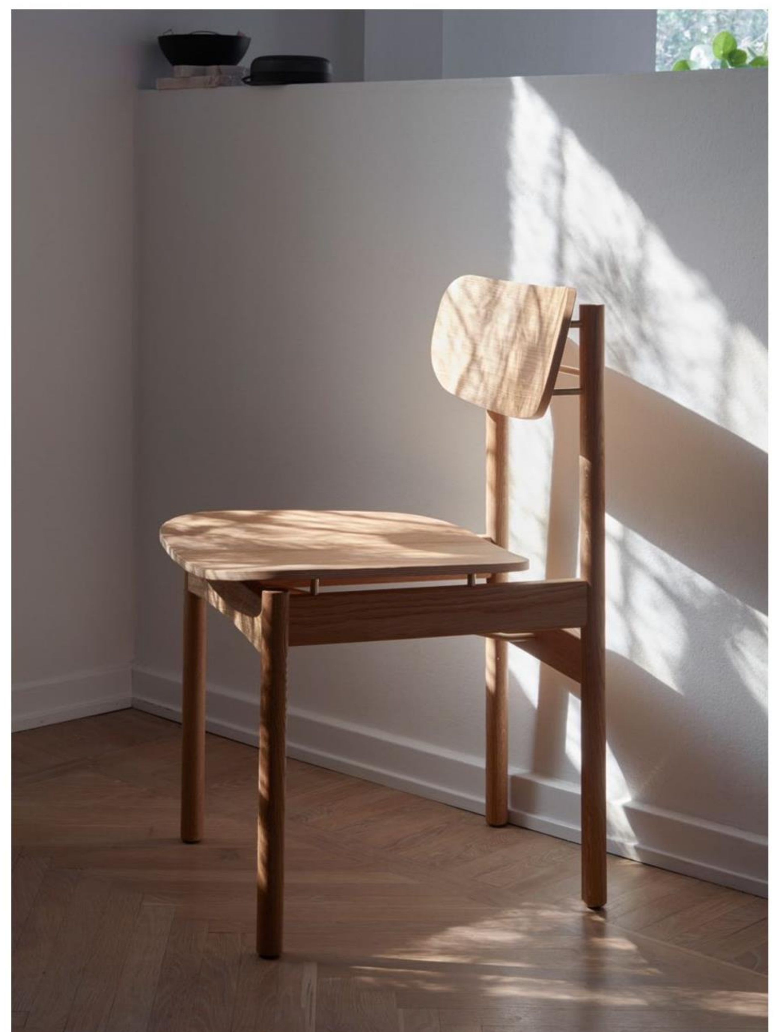
Vester Chair in oiled oak

A transverse brass rod that indicates where you pull out the chair. Legs that continue up into the backrest and become a small hook, where you can hang your purse. A body in golden oiled oak that naturally contrasts the details in brass. Vester Chair is elegant in a discreet way and understated without losing its momentum.