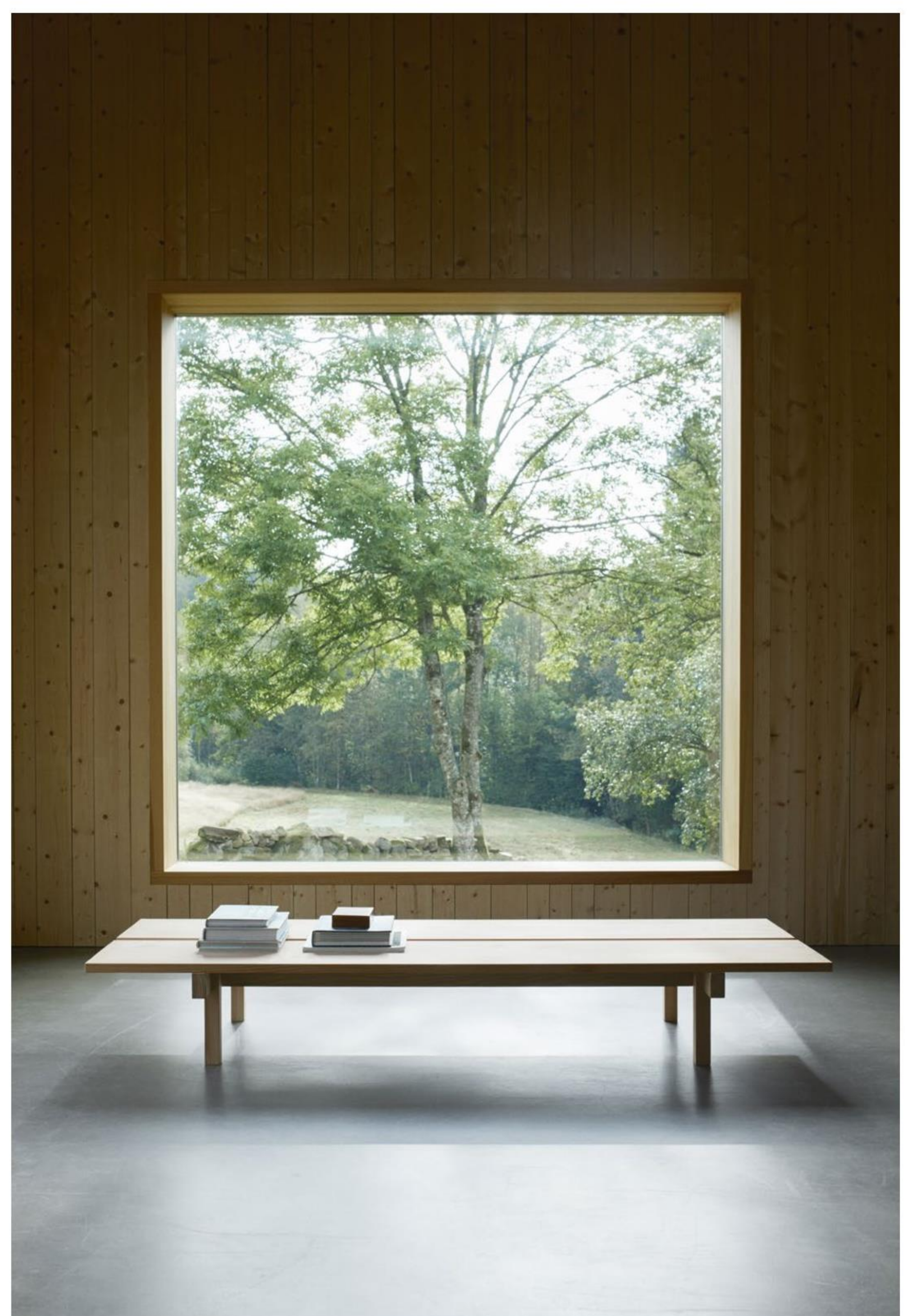
Reykjavik Daybed in Douglas Pine

Reykjavik daybed is almost small scale architecture and a rigorous, modernistic and rustic piece of furniture. Made from solid German Douglas Pine, the daybed strikes a stunning pose in your living room or hallway, while being a functional seat at the same time.