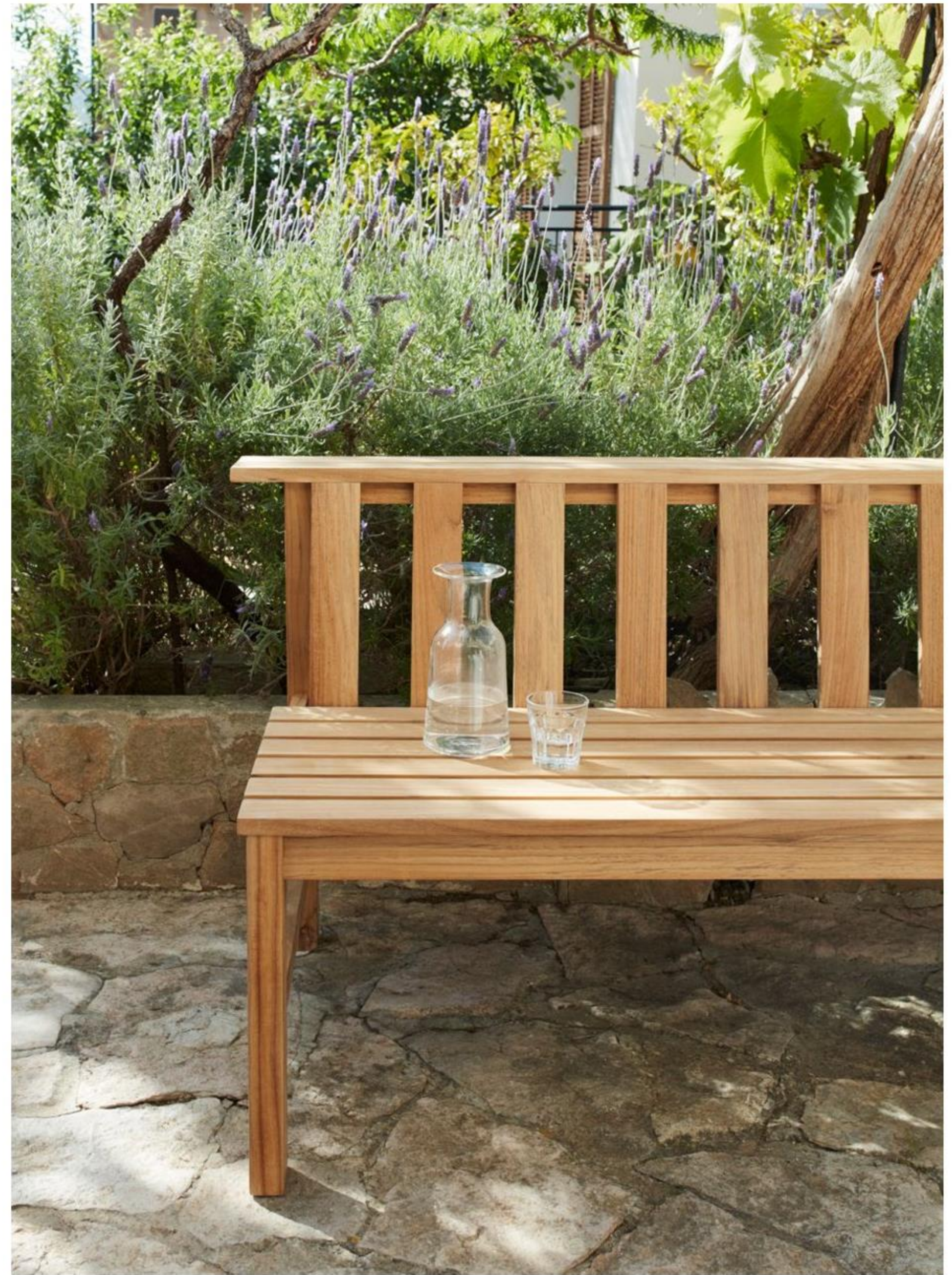
Plank Bench in teak

Plank was created when designer Aurelién Barby designed a collection of enduring outdoor furniture with function beyond its intended purpose. The result is a complete and characteristic collection for relaxing and entertaining outdoors.