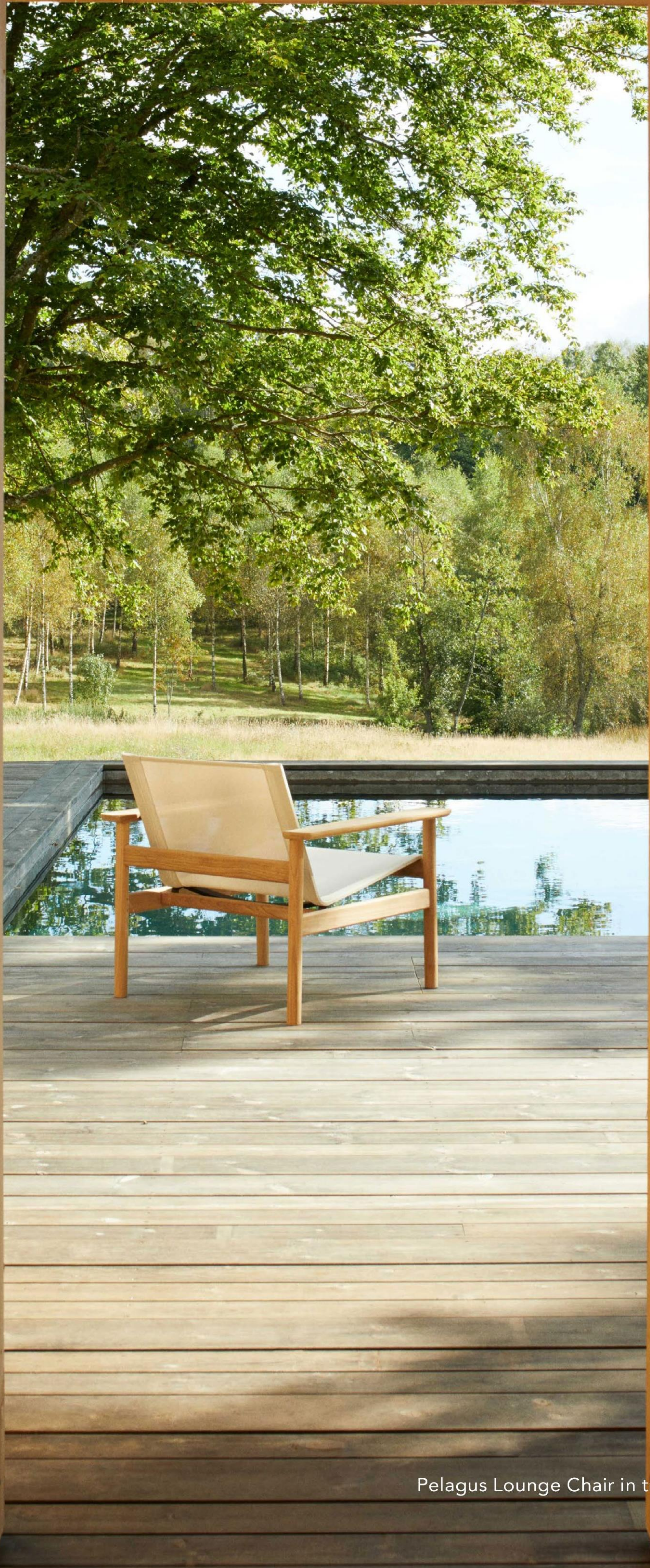
Pelagus Lounge Chair in teak and Sling fabric