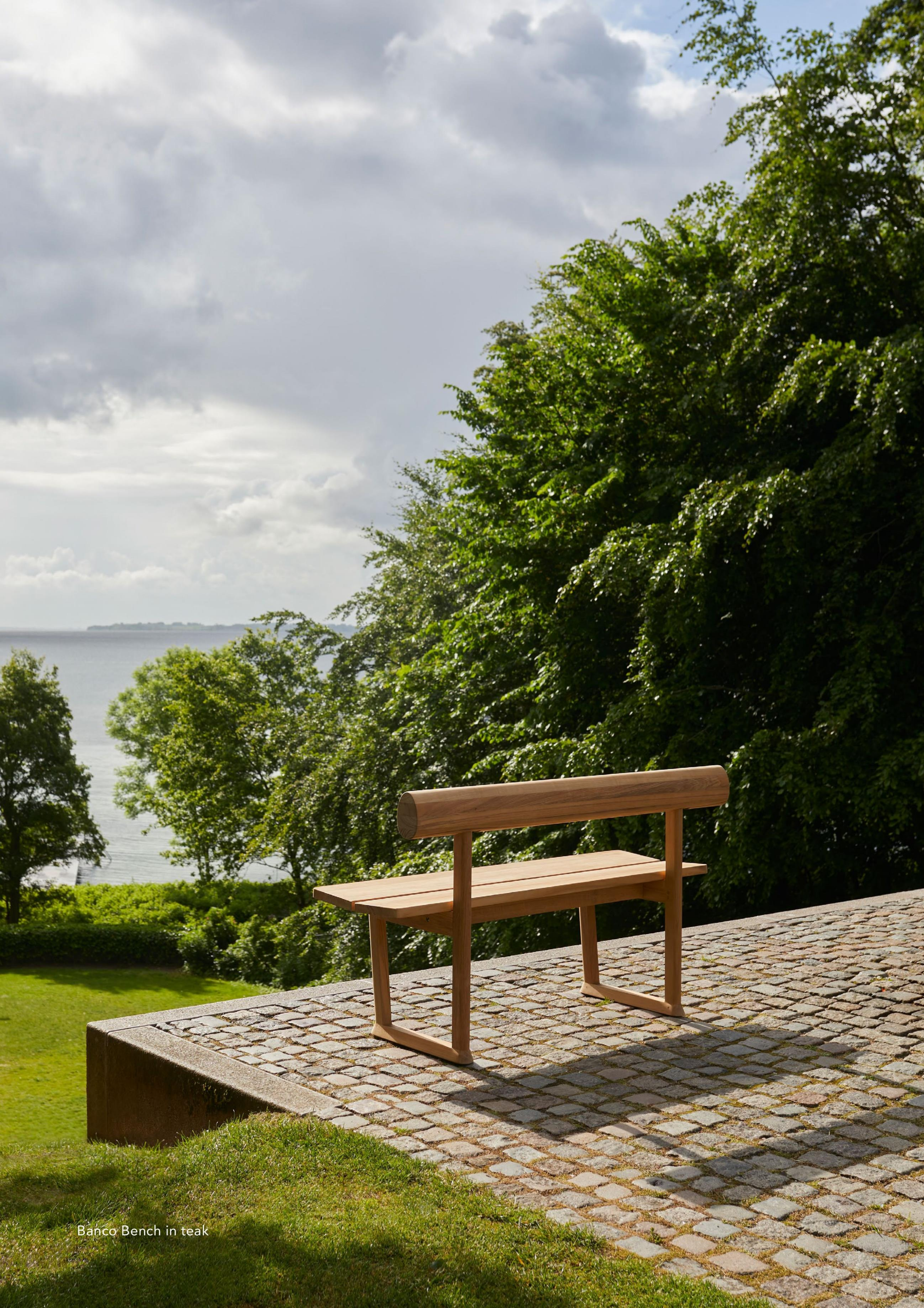
Banco Bench in teak