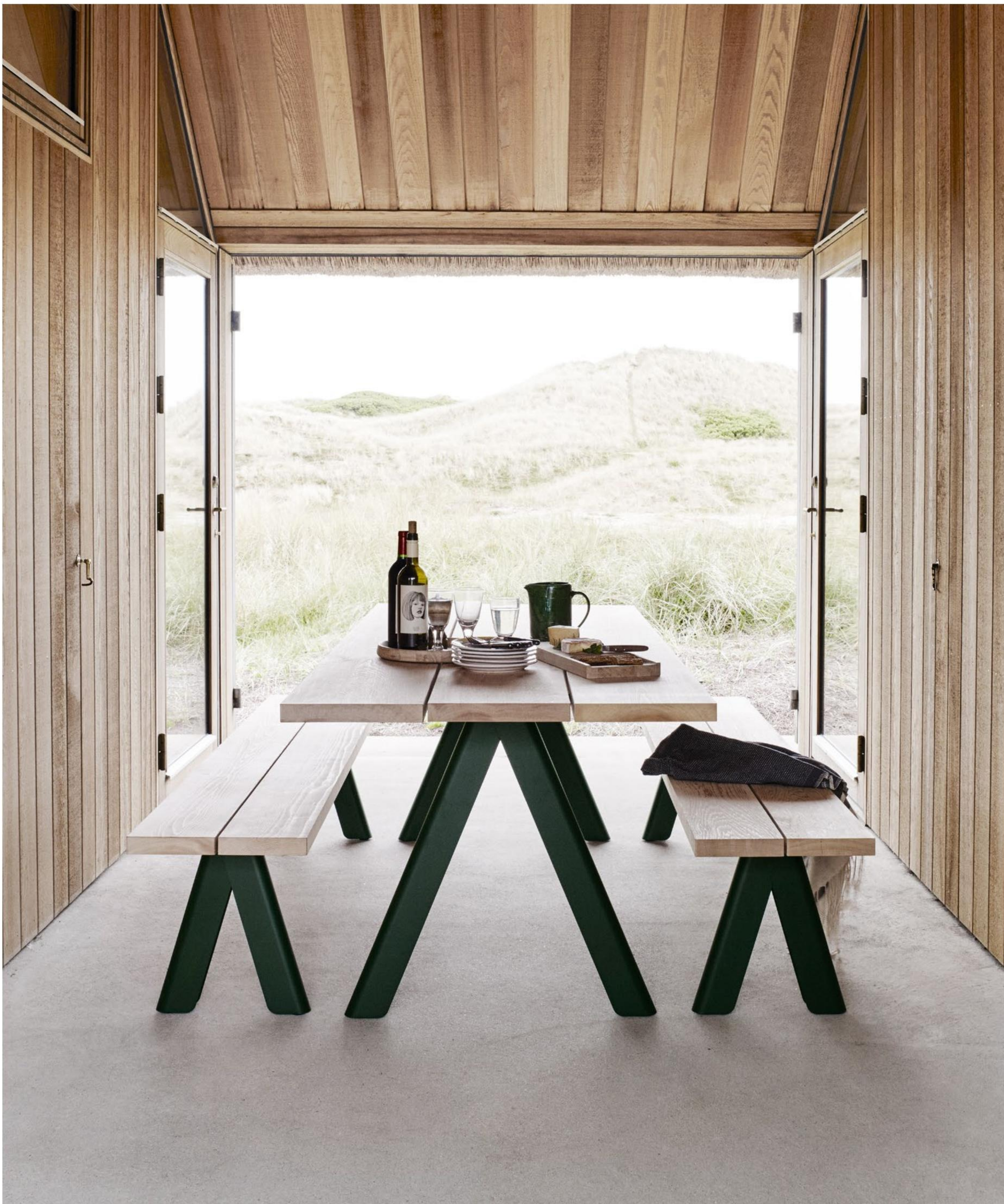
Overlap Bench and Table in Western Red Cedar

Our Overlap collection stands strong on its legs. Thanks to the rustic wooden planks and its steel base, the series has a modern edge and contemporary appeal. Perfect for both indoor and outdoor use.