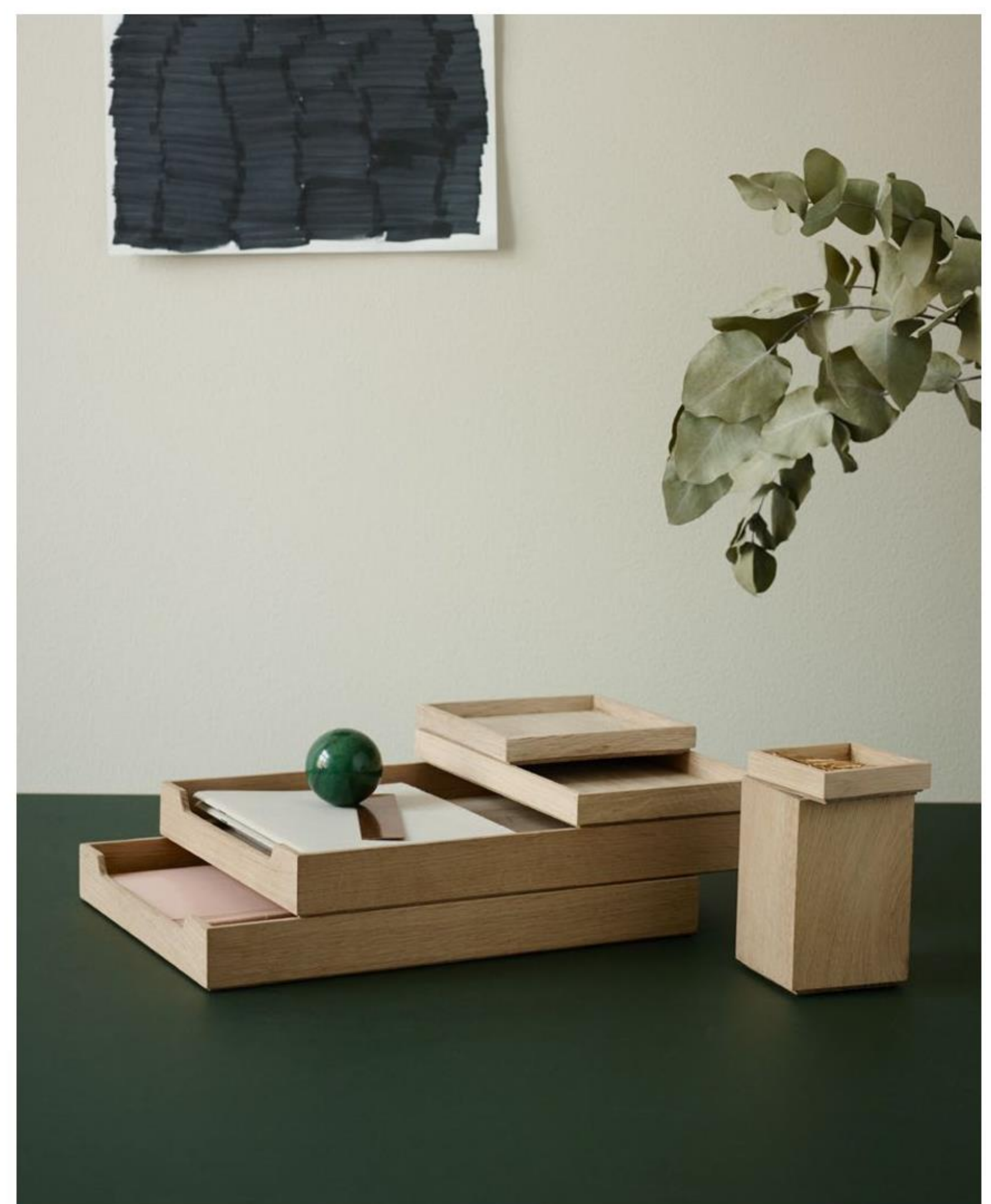
Nomad Letter Tray, Pen Holder and Trays in oak

Accessories and personal objects are the details that can transform any interior into a home.