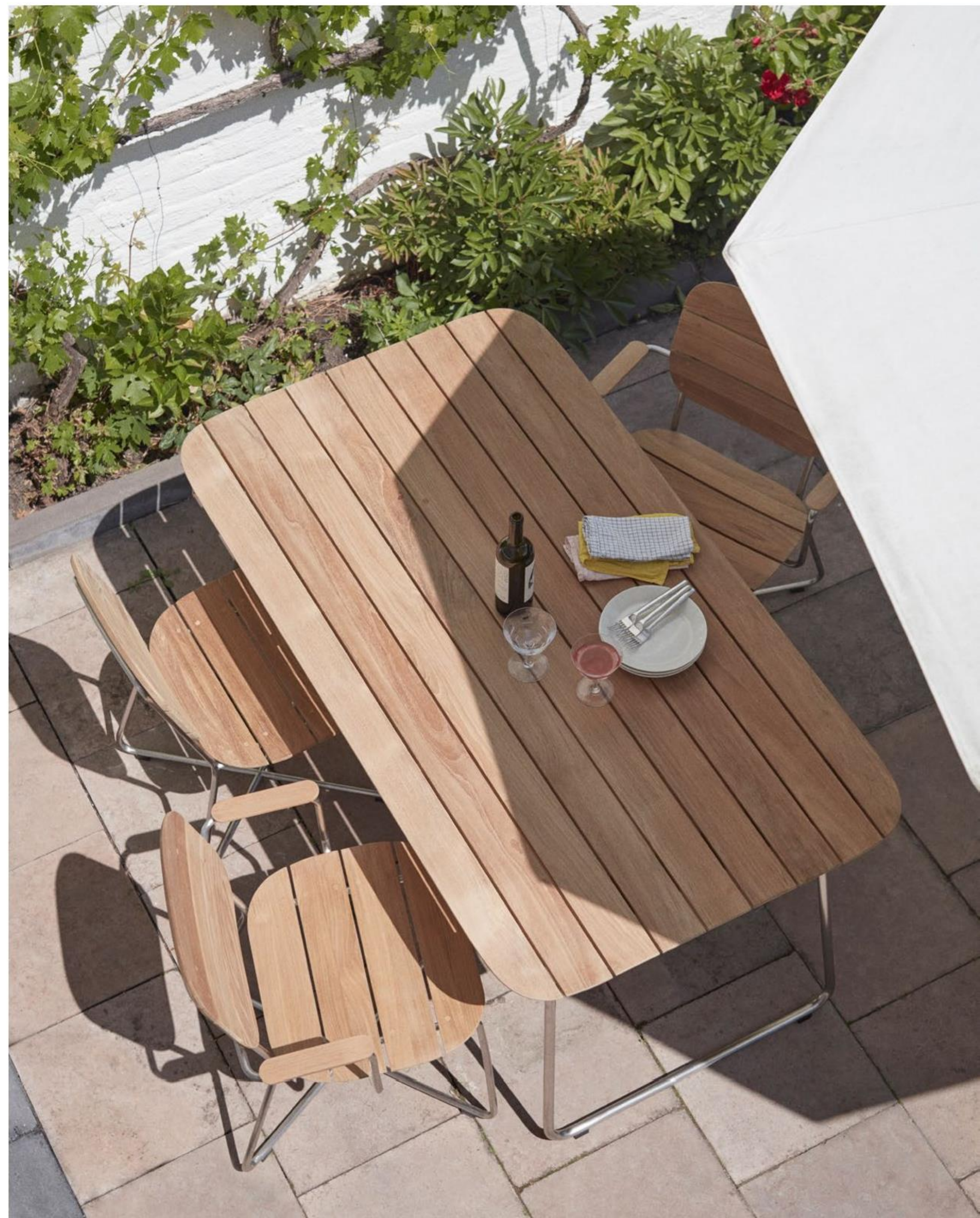
Lilium Chair and Table in teak and stainless steel

Pelagus has a graceful contemporary expression while still being high on comfort and versatility. Whether in a city or in a rural setting, Pelagus makes a wonderful addition to any lifestyle and setting.