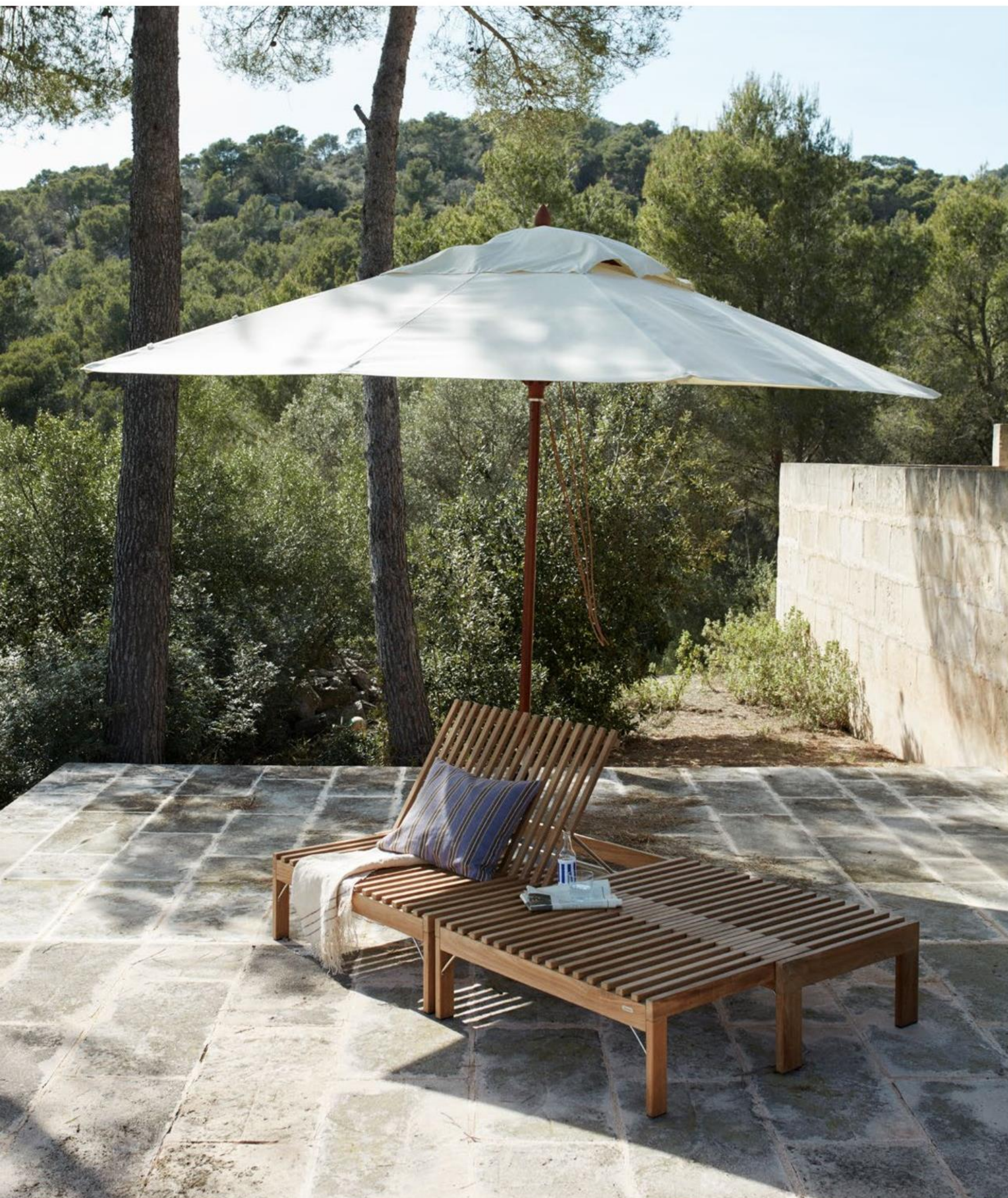
Riviera Lounge in teak and Messina Umbrella