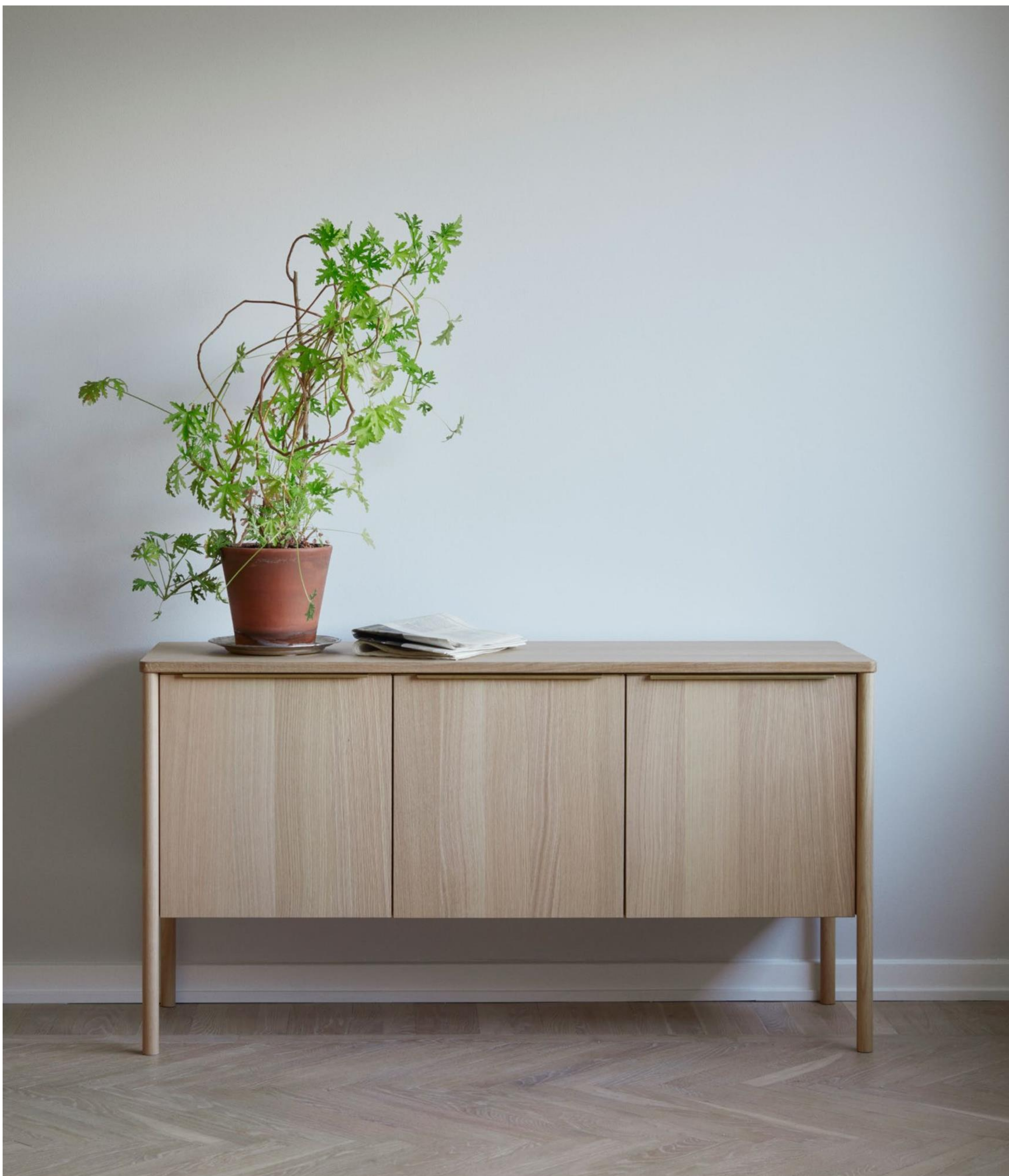
Jut Cabinet in oiled oak

Jut is a cabinet that stores its content with grace. A noble gesture, slim legs and a top in either oak or marble underline the elegance of this contemporary piece of furniture.