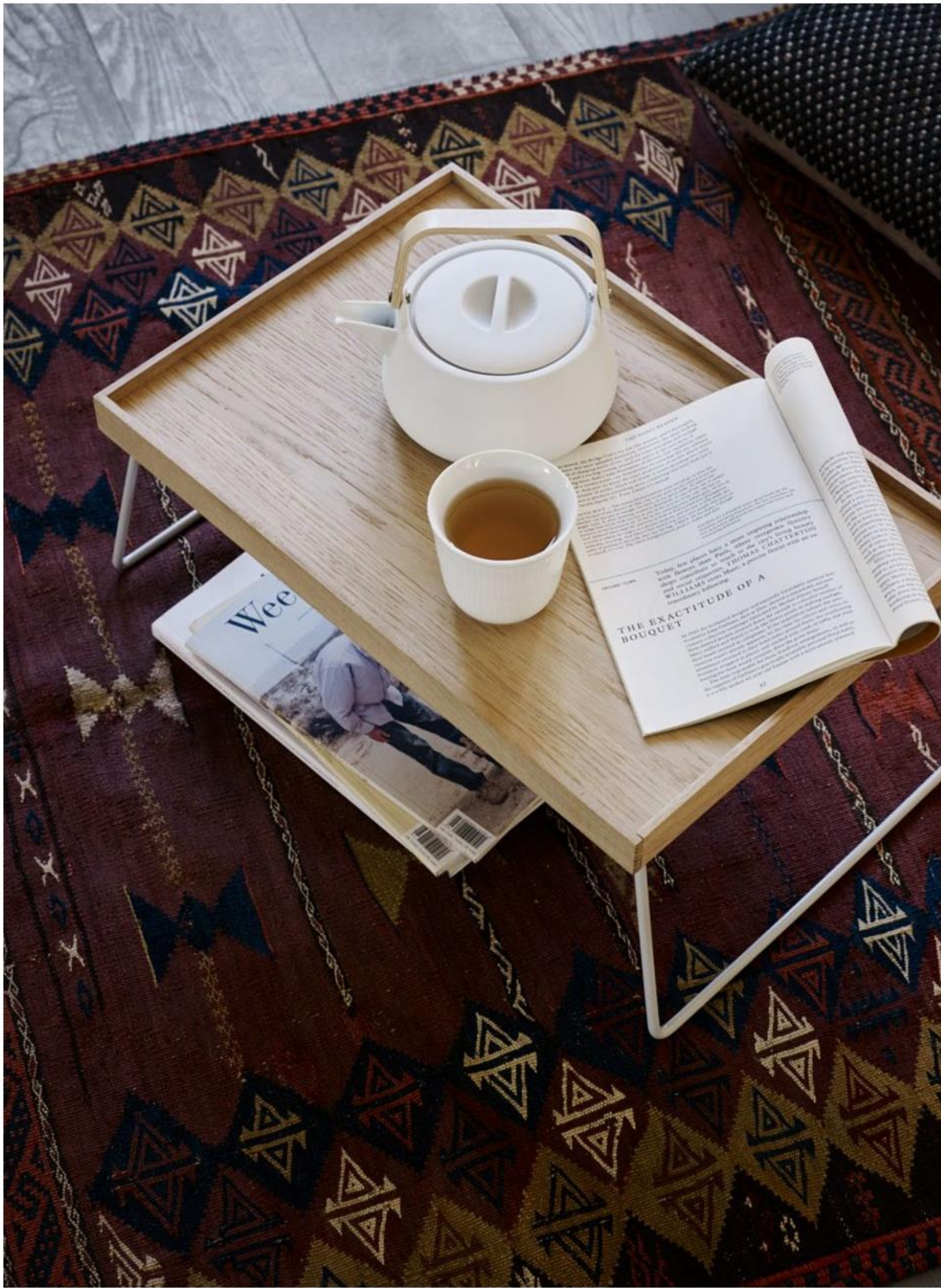
Nomad Table Tray in oak and steel