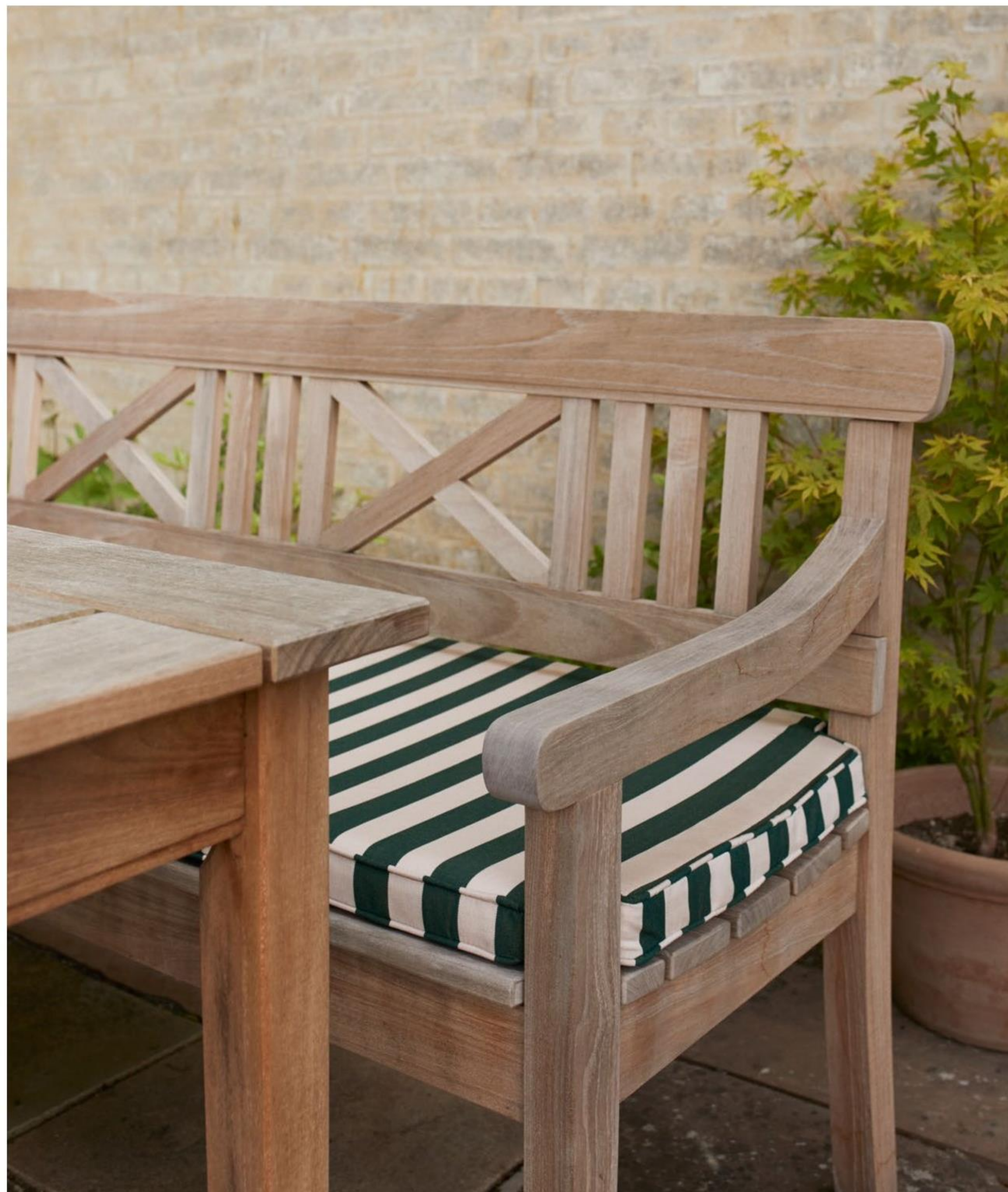
Drachmann Bench in teak with Cushion in Agora Lines fabric

The Drachmann series is one of Skagerak's first collections. The signature collection in teak is inspired by an old romantic garden of the Danish poet and painter Holger Drachmann, and due to its balance between Nordic nostalgia and modern simplicity it is still a Skagerak bestseller.