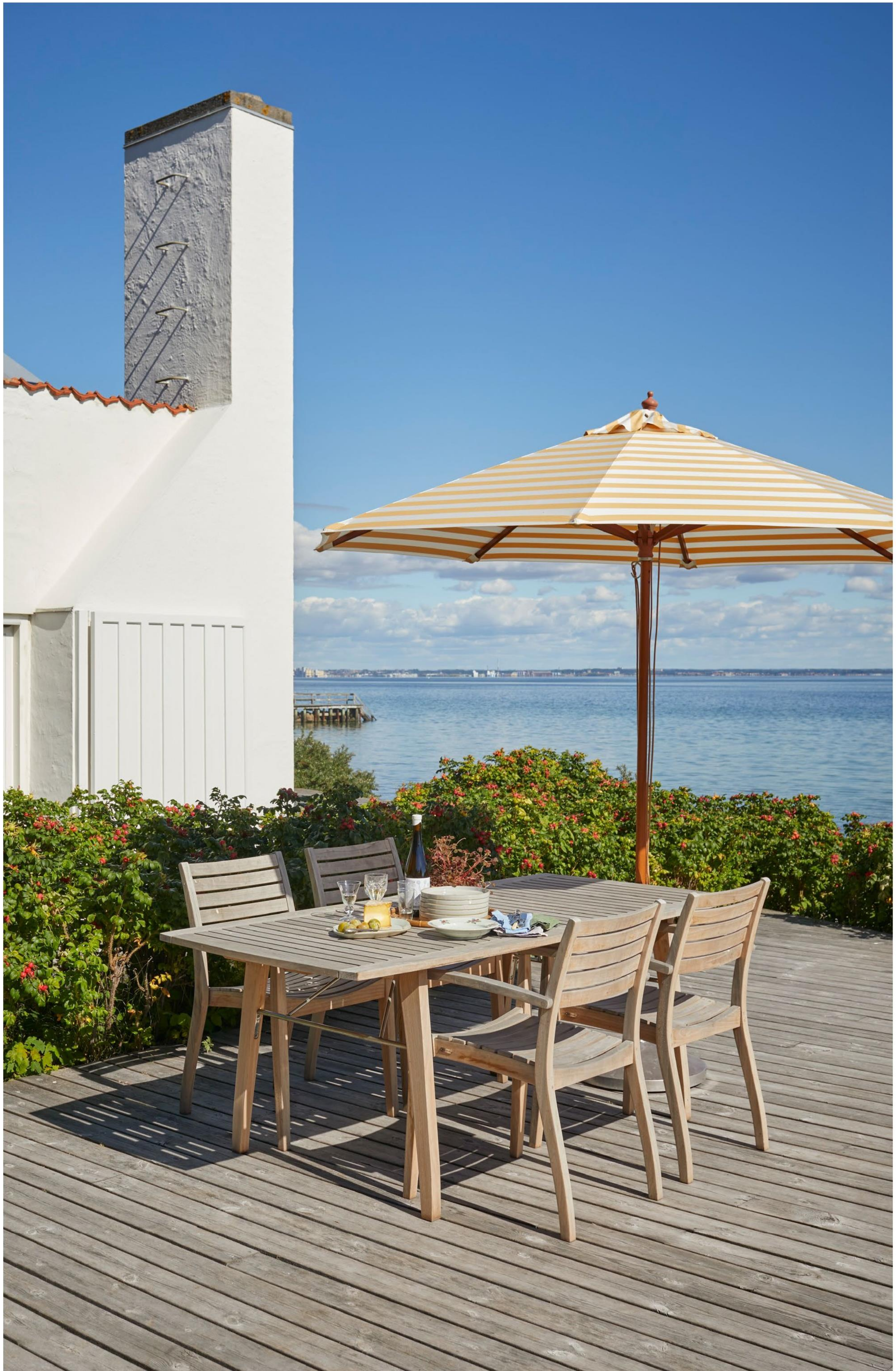
Messina Umbrella in kapur, and Ballare Armchair and Table in teak