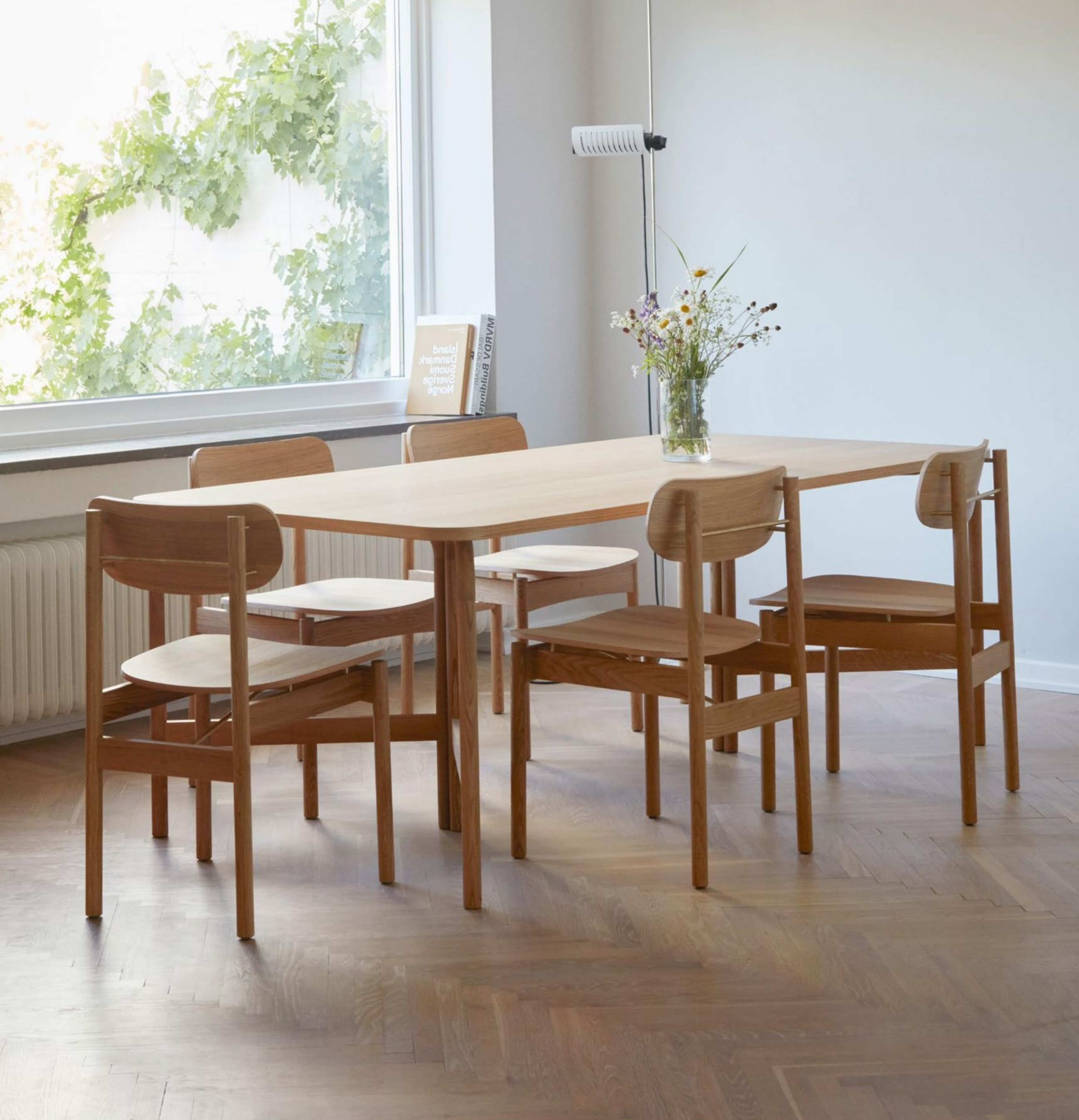
Vester Chair and Aldus Table in oiled oak