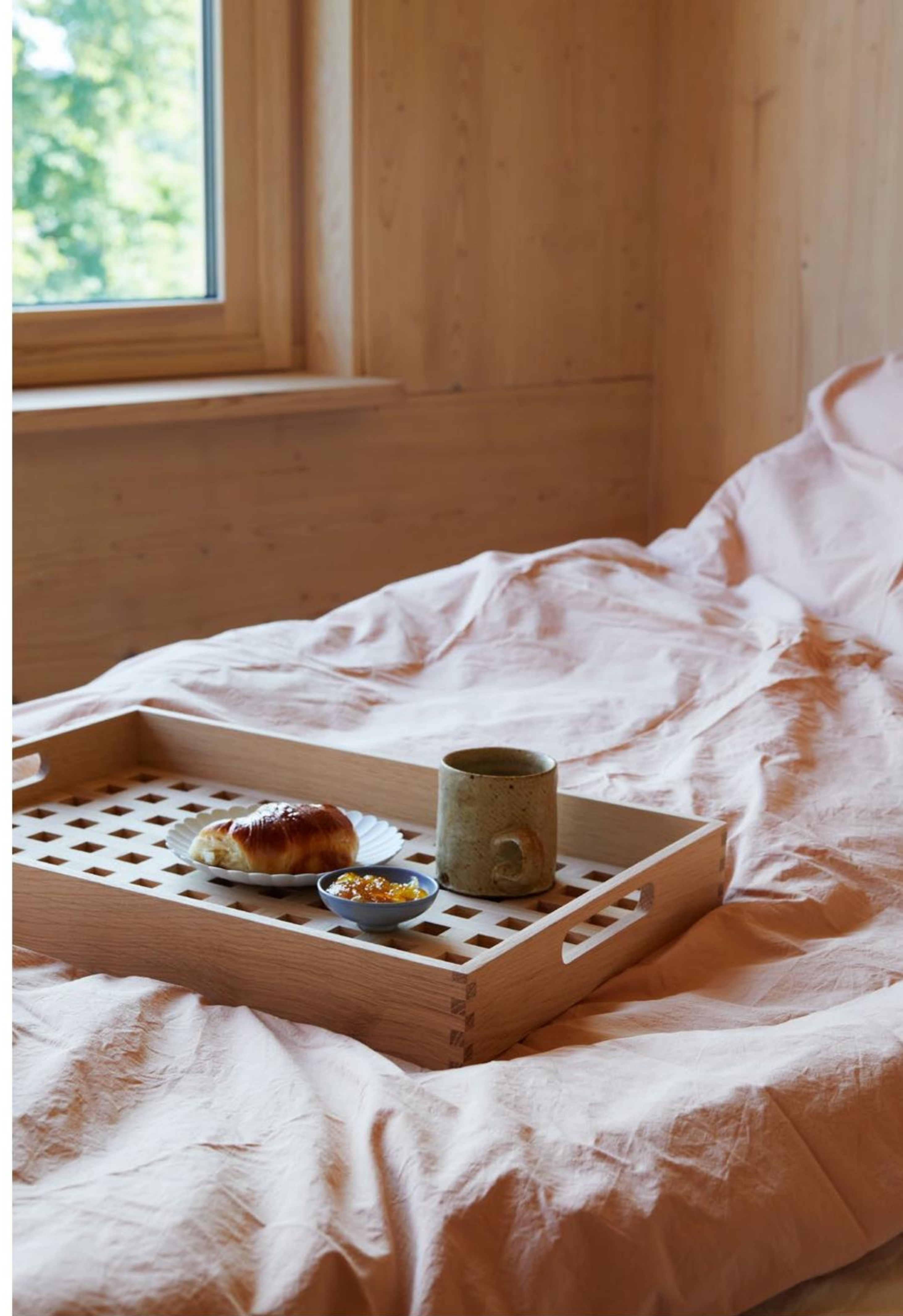
Fionia Tray in oak