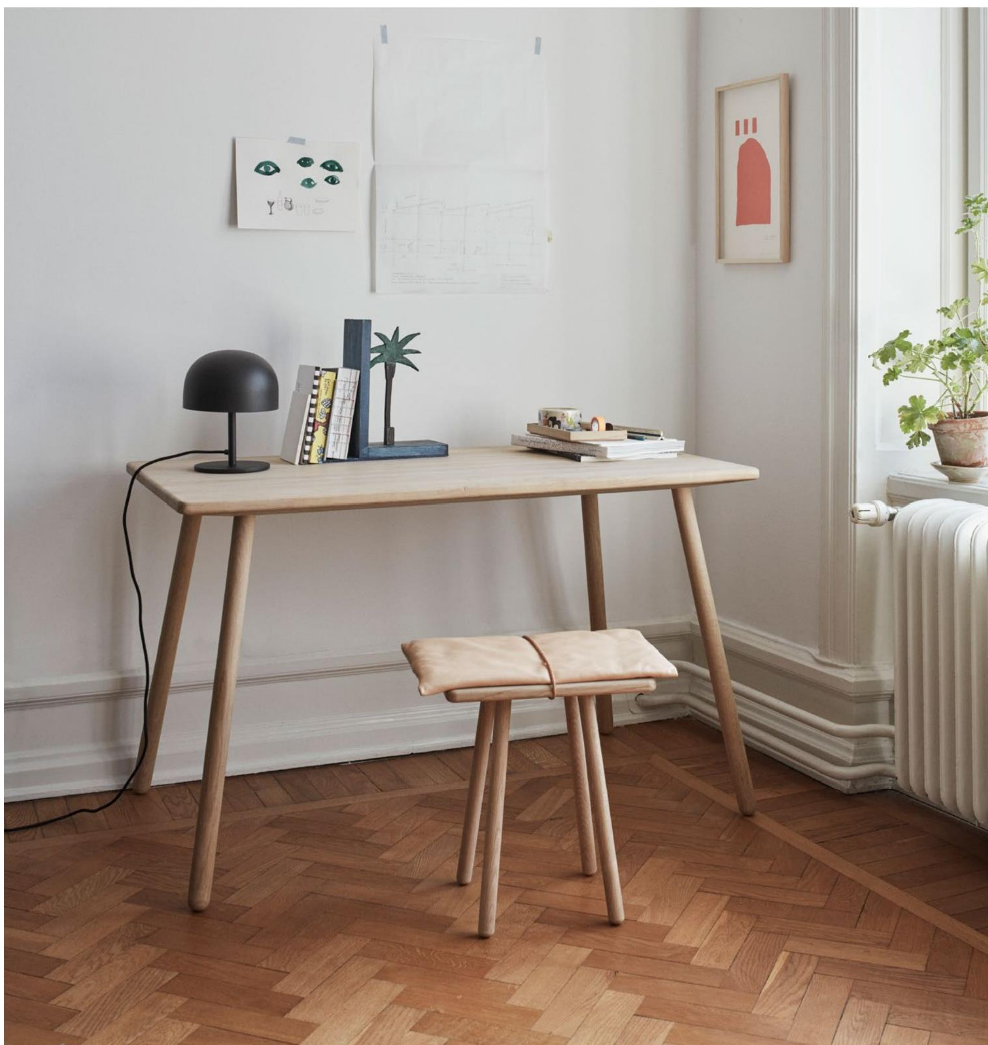
Georg Desk and Stool in oak