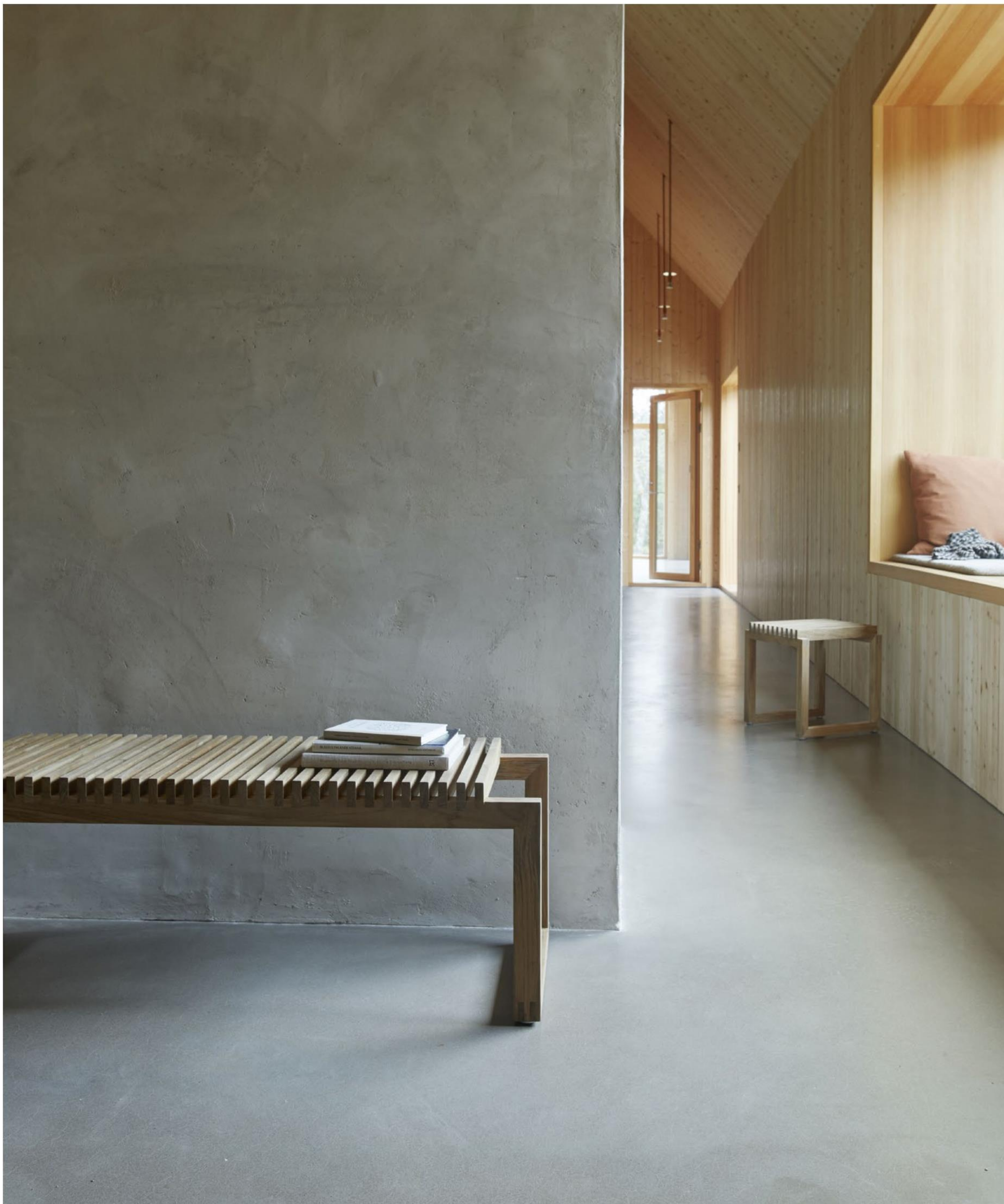
Cutter Bench and Stool in oak

Our iconic Cutter collection is minimalistic and functional and ideal for your hallway. Go for our Cutter Bench and matching accessories such as the Cutter Box or Cutter Mini Wardrobe.