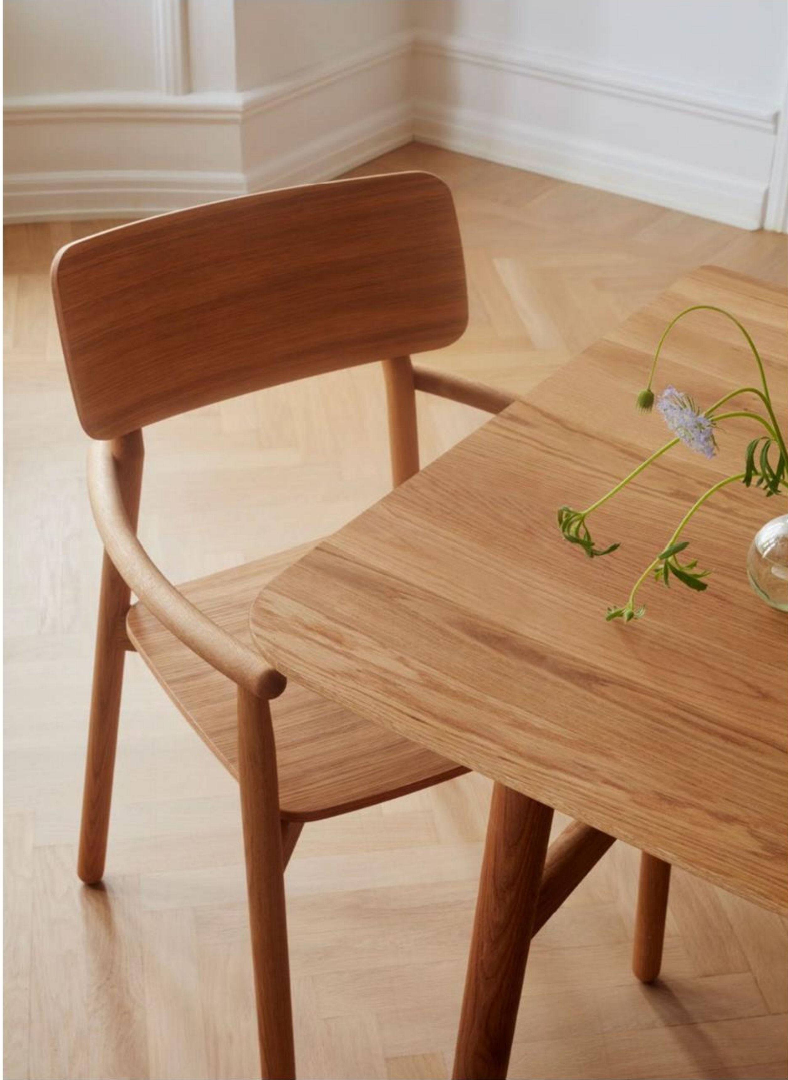
Hven Armchair in oak