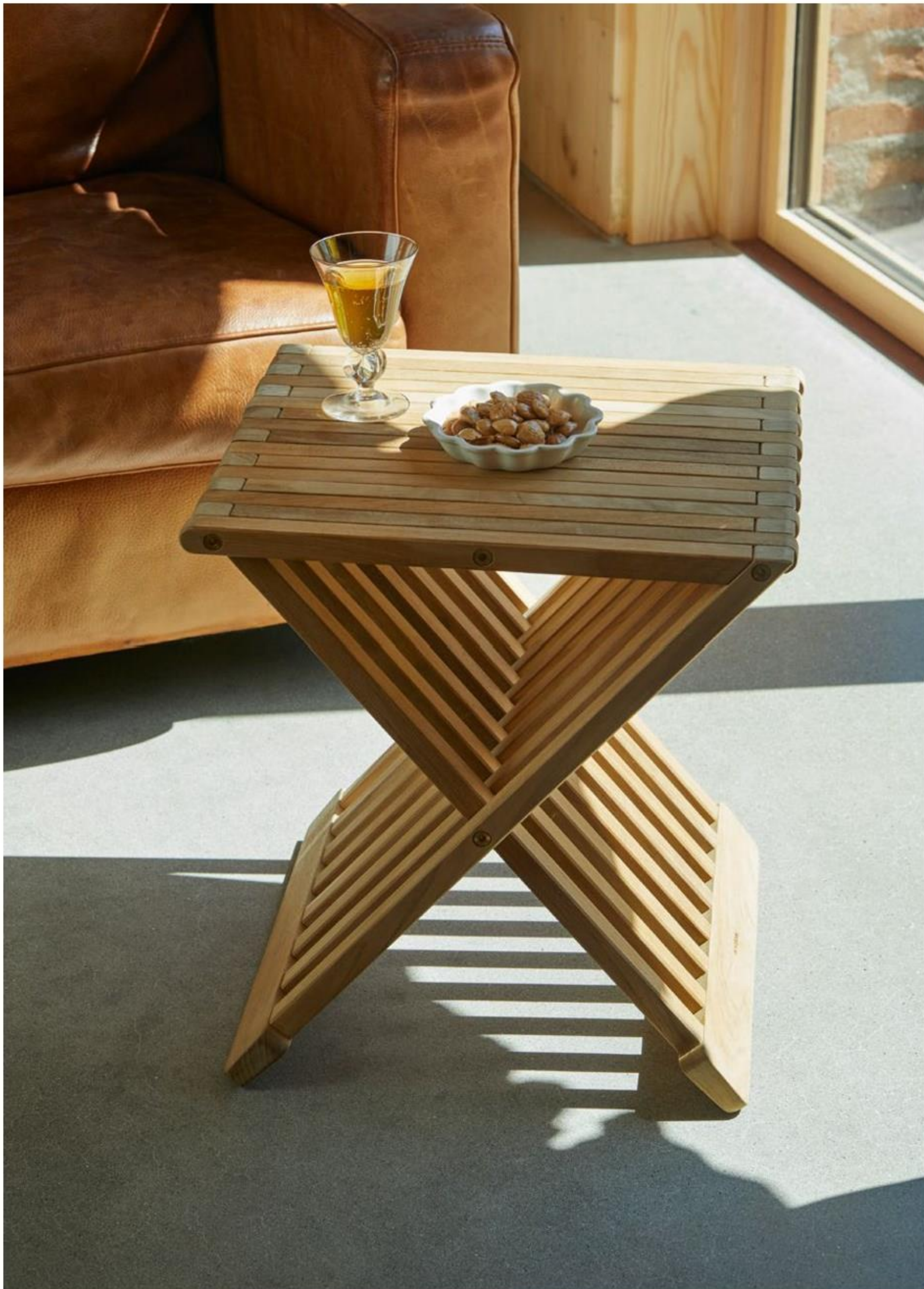
Fionia Stool in oak